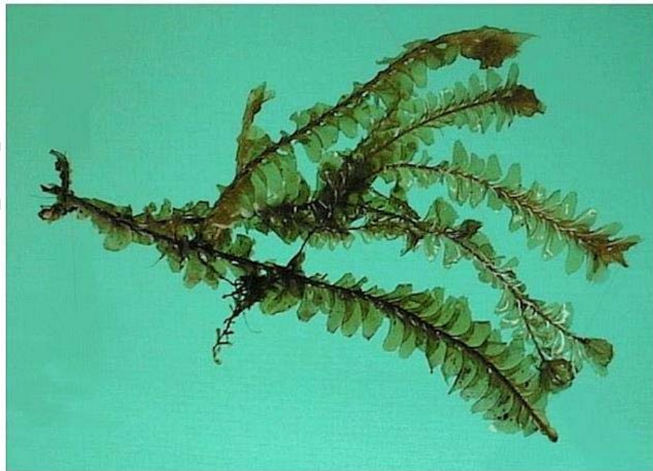
Figure 3. Dumortiera hirsuta , a thalloid liverwort growing on basaltic rock.