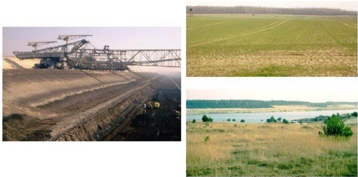
Figure 2. Open cast mining (brown coal) in the Cottbus district (Germany). Left active mine, right artificial agricultural landscape on former mining area (top) and habitat rich reclamation (bottom).