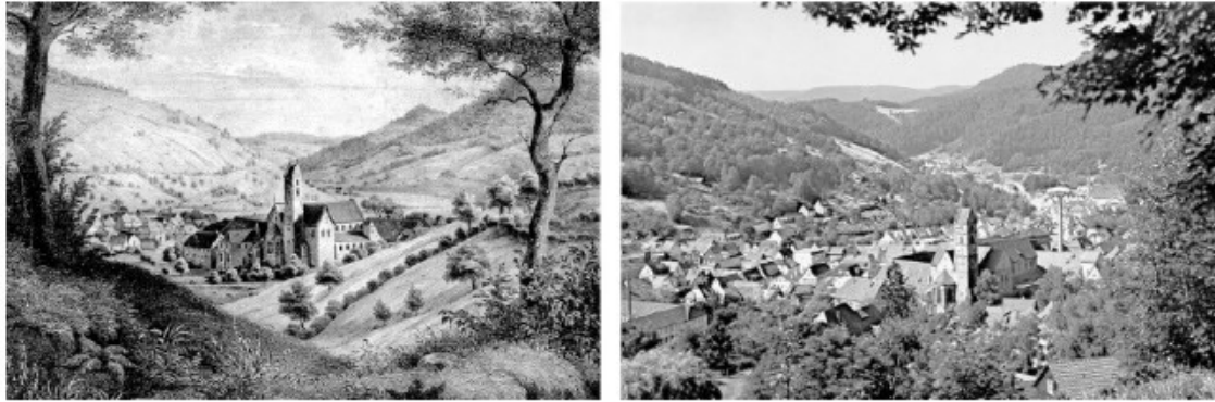
Figure 1. Regrowth of forest in a valley in the black forest (Germany). Left 1936, right ca. 1990.

as fire, storms, landslides, avalanches, insect pests, etc., differ from deforestation in scale, frequency and intensity. They lead to complex mosaics in the landscape which shift over time. The communities have adapted to such disturbances and the soil may regenerate. For forests, the time scale of regeneration is in the range of hundreds of years. In some regions of the world, as in Europe, the regeneration potential of soil and vegetation allowed for an increase of forest cover in modern times (see Figure 1).