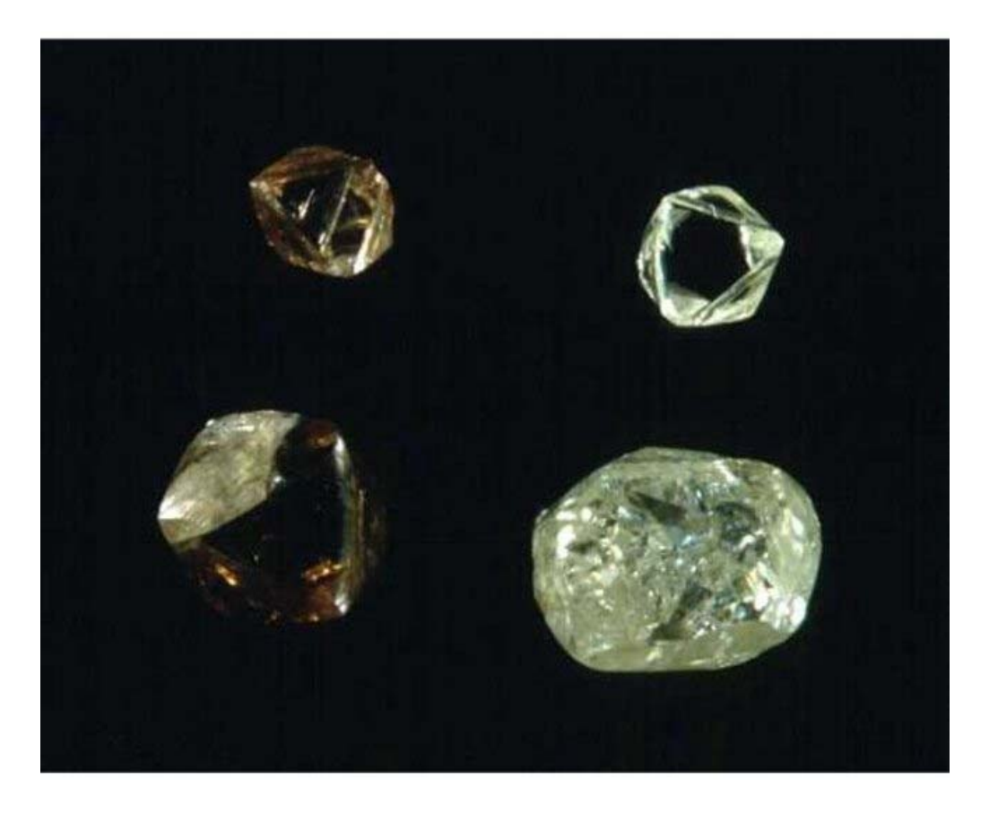
Figure 1. Raw diamonds, South Africa

Among naturally occurring materials, diamond is characterized by extraordinary physicochemical properties. From a crystal chemical point of view, diamond is the highpressure, cubic form of carbon (space group Fd3m, class m3m), which is stable in the Earth at depths greater than ca. 120 km at 800 °C, increasing to greater than ca. 170 km at 1400 °C. It usually crystallizes as colorless or pale yellow to orange, brown, gray, or black octahedra, cubes, dodecahedra, and combinations of these forms. Twinned crystals may exhibit a flat habit known as "macle" and partially etched grains may appear rounded. Rarer colors are pink, red, green, blue, and violet. Diamond is a superb heat conductor and an excellent electrical insulator, although the gray-to-blue variety known as type IIb behaves as a semiconductor. Its extreme hardness (10 Mohs scale; 56–115 GPa Knoop Hardness Number), elevated melting point (3550 °C), very low reactivity to chemicals, and high refractive index (2.417), which confers it a prominent, adamantine luster, intense light dispersive properties, and great durability, make it one of the most sought-after industrial minerals and most appreciated gems.