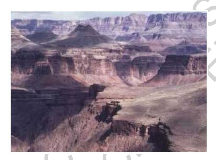
Figure 3. Among the grandest of vistas created by Earth's geology: the Grand Canyon of the Colorado River, in Arizona, USA.

deposited in the oceans, to be recycled through volcanism by plate tectonics. Sedimentary layers on continents or their margins may be buried, heated and subjected to modest pressures, leading to so-called metamorphic rock. This again may be uplifted and then exposed in new mountain ranges or plateaus, along with igneous rocks and sedimentary layers, to be eventually eroded by water to sediments once more. Divergence of continents along new plate margins (see below) may instead drop large amounts of sediments into deep basins. Within all of this activity, chemistry on small to large scales is ongoing, much of it with the mediation of life; as well the melting of rock within continents may produce and separate ores of valuable metals eventually accessible for extraction. The details of many of these processes are provided in the accompanying articles, but one should not forget as well the inspiring beauty created as well by geologic processes (Figure 3).