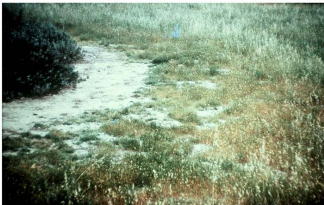
Figure 2. A unique pattern of herb exclusion by a California chaparral species, Salvia leucophylla , exhibiting a bare zone of 1 to 2 meter wide close to the shrub (A), an inhibition zone about 3 to 4 meters wide (B) next to the bare zone, and a normal growth of herbaceous plants beyond the inhibition zone.

Natural product chemists and biochemists studied the structure, biosynthesis, and natural distribution of secondary plant metabolites, but less attention was focused on function of the compounds. The metabolites are often stored in vacuoles or intercellular spaces when they are not being used. However, the compounds may be freely released to the cells or to the surface of leaves for defense, attraction, or as chemical signals. Even more, such compounds act as messengers in plant-insect interaction, and have an important role in the mechanisms of plant adaptation and insect co-evolution. Since then, secondary metabolites have no longer been regarded as metabolic wastes and the role of allelopathy in physiological, biochemical, and ecological functions has been increasingly understood.