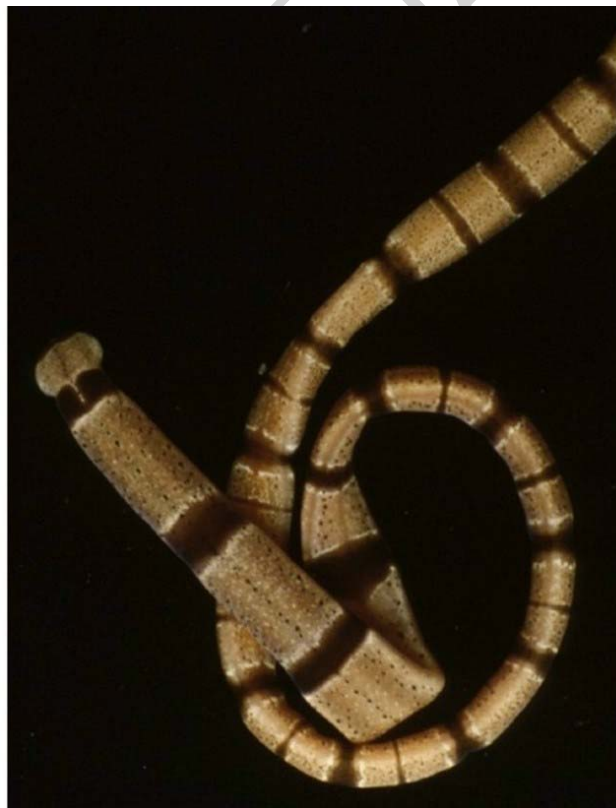
Figure 5. Tubulanus rhabdotus, a representative of Palaeonemertini

Within Nemerteans, two groups are distinguished. In Anopla the proboscis and mouth opening are separate, in Enopla, there is usually one opening. Anopla include the Palaeonemertini and the Heteronemertini (with pilidium larva), to which the well-known genus Lineus belongs. Enopla include the Hoplonemertini, which have one or more stylets in the proboscis, and Bdellonemertini, to which the bivalve commensal Malacobdella belongs. Hoplonemertini are distributed over a diversity of habitats, including pelagic (e.g., Nectonemertes ), fresh water (e.g., Prostoma ), and terrestrial (e.g., Geonemertes ) environment.