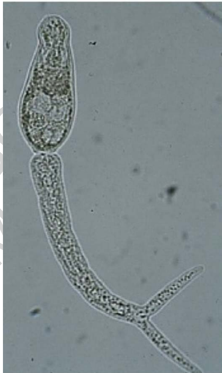
Figure 3. Cercaria of Schistosoma mansoni

Tapeworms (Cestoda) are endoparasites with, usually, an intermediate and a final host. The body is divided into numerous segment-like parts called proglottids that include almost only the reproductive system. The posteriormost proglottids are full of fertilized