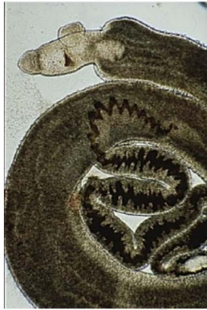
Figure 2. A pair of Schistosoma mansoni with larger male and smaller female