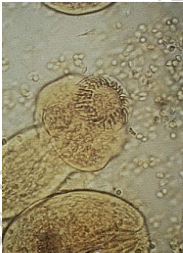
Figure 4. Infective stages of Echinococcus granulosus as a product of asexual reproduction in cysts (hydatids). Note the scolex with hooks with which the worm attaches itself to the intestinal wall

eggs. They are separated and released to the outside through the host's intestine. The worm is anchored in the host's intestinal wall by hooks and suckers on the anterior end, the scolex. The eggs are often ingested by the intermediate host, which, in turn, is eaten by the final host. Humans can become infected by, for example, the bovine tapeworm Taenia saginata , through eating raw beef containing encysted larvae. Adult Taenia saginata live in the intestine of several carnivorous hosts. The eggs leave the host with the feces and may be ingested by cows. Then a larva, the oncosphaera, hatches and penetrates the intestinal wall. It reaches the musculature through the circulatory system and encysts there. If this musculature is eaten by a carnivorous animal or human, Taenia excysts, anchors itself in the intestinal wall with its scolex, and the cycle is complete. Some tapeworms, such as Echinococcus granulosus , can be of considerable medical importance because they form large cysts with asexually reproducing larvae that are extremely difficult to remove and are potentially deadly to humans.