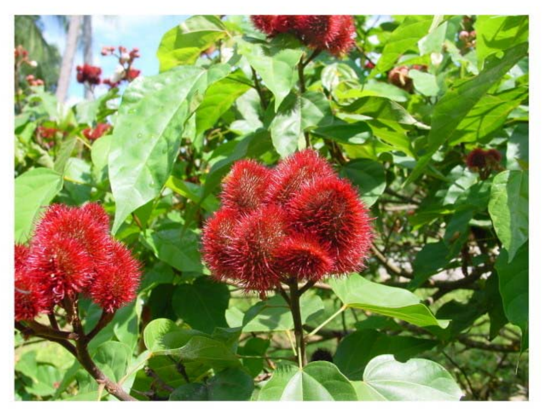
Plate 1. Bixa orellana L. (Bixaceae), urucu, roucou, or "lipstick tree"

The astonishing reddish color from seeds of the tropical annatto tree (urucu or roucou), Bixa orellana L. (Bixaceae), was caused by a pigment with an atypical structure, bixin (see Plate 1 and Figure 1). This natural coloring matter, identified as a diapocarotenoid with a chain of 24 carbon atoms and a double bond with cis configuration, is responsible for the vast use of this seed to color foods, such as margarines and cheeses, as well as cosmetics. Many biological actions are also attributed to the annatto seeds, from digestive and expectorant, to aphrodisiac and insect repellent. Probably, this latter activity should be the true reason for the indigenous use of this natural pigment.