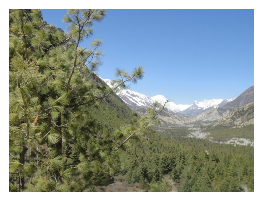
Figure 2. Photo shows a complex landscape of Nepal from low valleys to higher Himalayan landscape.

Due to diverse and extreme physio-climatic variation in Nepal, it harbors diverse ecosystems from tropical to temperate to alpine (Figure 2). Owing to its diverse climatic conditions some of the most unique and economically valuable MAPs are found in Nepal. The Himalayan elevation gradient is the longest bioclimatic gradient in the world extending from c. 60 to more than 8000 m within 150-200 km, south to north transect, and comprises tropical/subtropical, temperate, sub-alpine and alpine climatic zones. Nepal has been considered one of the biodiversity rich countries in the world. It is estimated that Nepal has more than 8,000 species of flowering plants, of which about 20-25% are recorded with medicinal and aromatic properties (Bhattarai and Ghimire, 2006). Regarding the number of MAPs in Nepal, different authors have reported different numbers. However, the number of MAPs may depend on the frequency of their use and type of traditional medical system practice. In Nepal, a maximum of 1,950 species of MAPs are reported (Ghimire, 2008); Tiwari et al. (2004) reported 1,700 MAPs; Baral and Kurmi (2006) reported 1,792 species. Only 143 species are found as commercial highly valuable medicinal plants which account for a significant amount of trade in the export (Bhattarai and Ghimire, 2006).