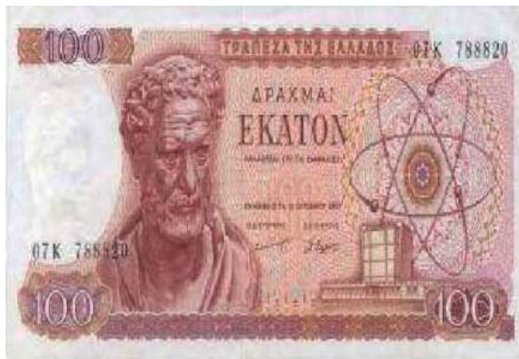
Figure 1. The 100 Greek drachma banknote with Democritus on one side.

The concept of atom was first mentioned by Democritus 25 centuries ago. He was a pre-Socratic philosopher, born in Abdera ca. 460 BC. Democritus had the belief that all kind of matter was made of various indivisible elementary units and declared that one can divide a sample many times, but at the end of a finite number of divisions, one would find the elementary unit called atomon . He also mentioned that the different forms of matter found in nature were combinations of a set of basic elements. Although he did not know those elements, he believed that they had a particular size, shape, and weight and the other physical properties like color are the result of complex interactions between the atoms of the observer and the sample under examination. In Figure 1 we show a banknote of 100 Greek Drachma as homage to Democritus.