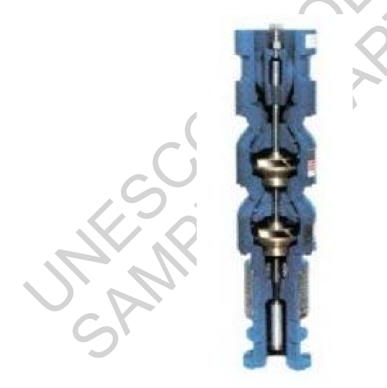
Figure 1: A two-stage submersible turbine pump for a submerged motor. The motor (not shown) is bolted to the bottom of the pump. Water enters through the screen just below the lower bell.

Pumps must be (1) small in diameter (to fit into the well) and (2) must develop high heads. Turbine pumps meet both requirements. Adding more bowls and impellers (see Figure 1) produces higher heads. The drivers are usually electric motors either (1) of small diameter mounted below and directly coupled to the pumps and therefore submerged in the water or (2) of standard size set above ground level with a long lineshaft to the impellers. Submersible motors are especially useful for wells deeper than 180 m and for crooked wells. Otherwise, lineshaft pumps are often preferred. After the well is drilled, it is "developed" by pumping at high rates to create pores that allow larger quantities of water to be pumped. Even solid granite can be made to yield water by shattering the rock with explosives or very high-pressure water.