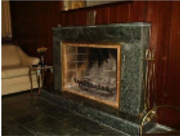
Figure 2: An open type conventional fireplace

forming a Venturi neck, while the rear wall behind the fireplace's back wall must continue its way up reaching the far down end of the chimney's back wall behind the Venturi neck. In this way, the V-shaped space formed behind the Venturi neck will divert upwards the flow of the cooled smoke that had followed down the chimney's rear wall surface. So, the diverted cooled smoke rising up will mix with the fast rising hot flue gases that have passed through the Venturi moving up the chimney.