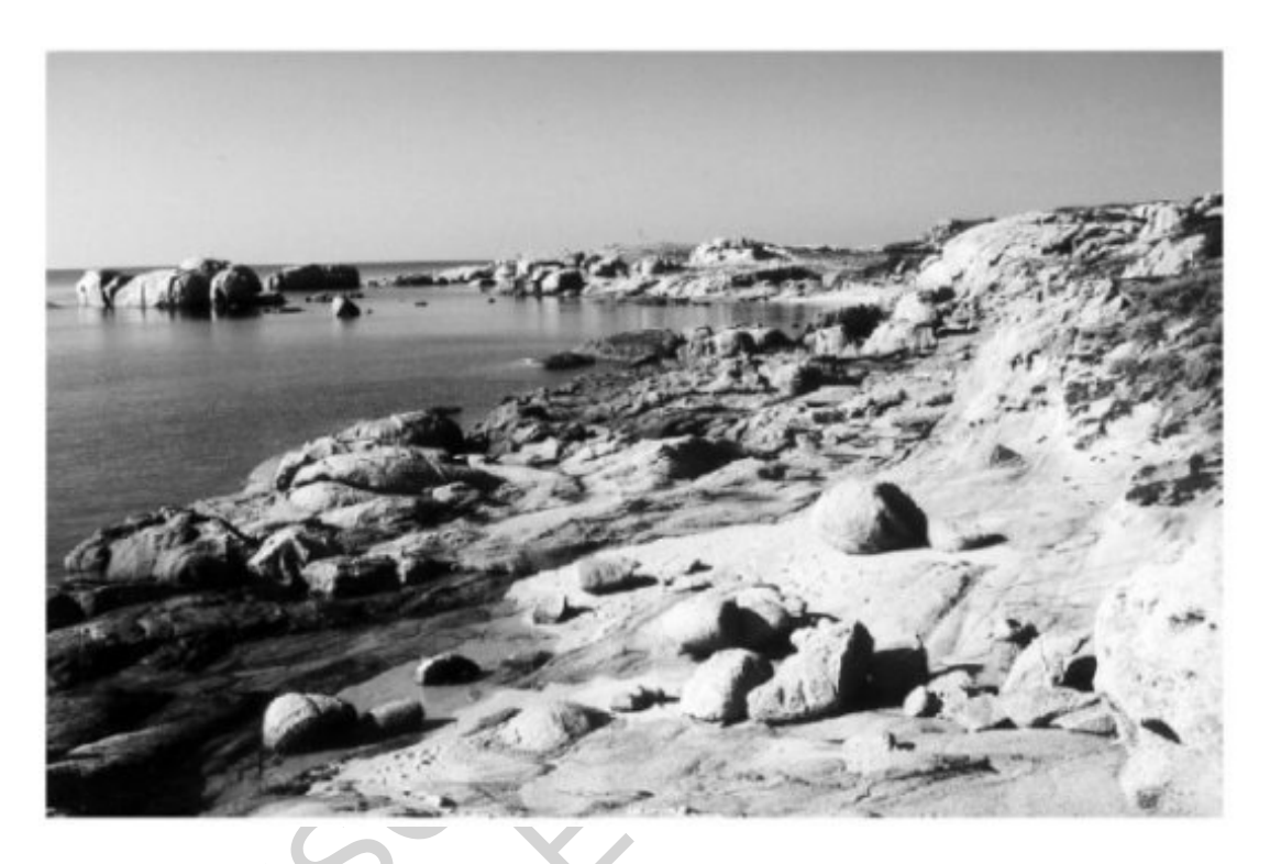
Figure 2. Low rocky coast, north-west Corsica Rocky coasts, especially those that are made of unconsolidated sediments or rocks with joints, faults or bedding structures, can present accentuated cliff retreat rates, that can lead to very serious environmental impacts and difficult management problems.

Rocky coasts are reflective coasts with high, steep cliffs (see Figure 1) consisting of consolidated sediments (lithified coasts) or unconsolidated sediments (unlithified coasts) with different mechanical strengths and an abrasional shore platform at the base which can be covered by clastic deposits forming small pocket-beaches. The height of the cliff is controlled by the nature of the hinterland, i.e. the composition, the slope, and the resistance of the rocks to erosion by marine, continental, and anthropic agents. There are also other kind of rocky coasts that are low and do not present cliffs (see Figure 2).