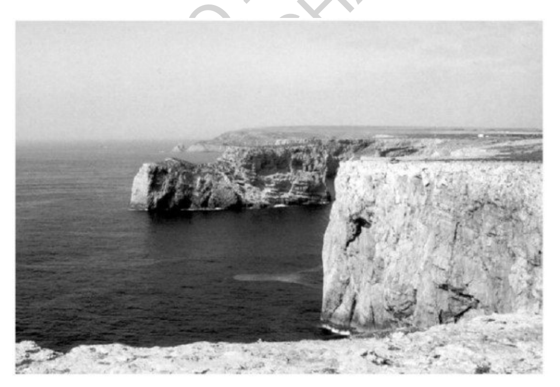
Figure 1. Plunging cliff, St. Vicente cape, south-west Portugal

Worldwide, rocky coasts extend over 80% of continental and island margins. Though they can have different origins, and their lithology and age vary along the coasts, they are always subject to a strong wave-climate.