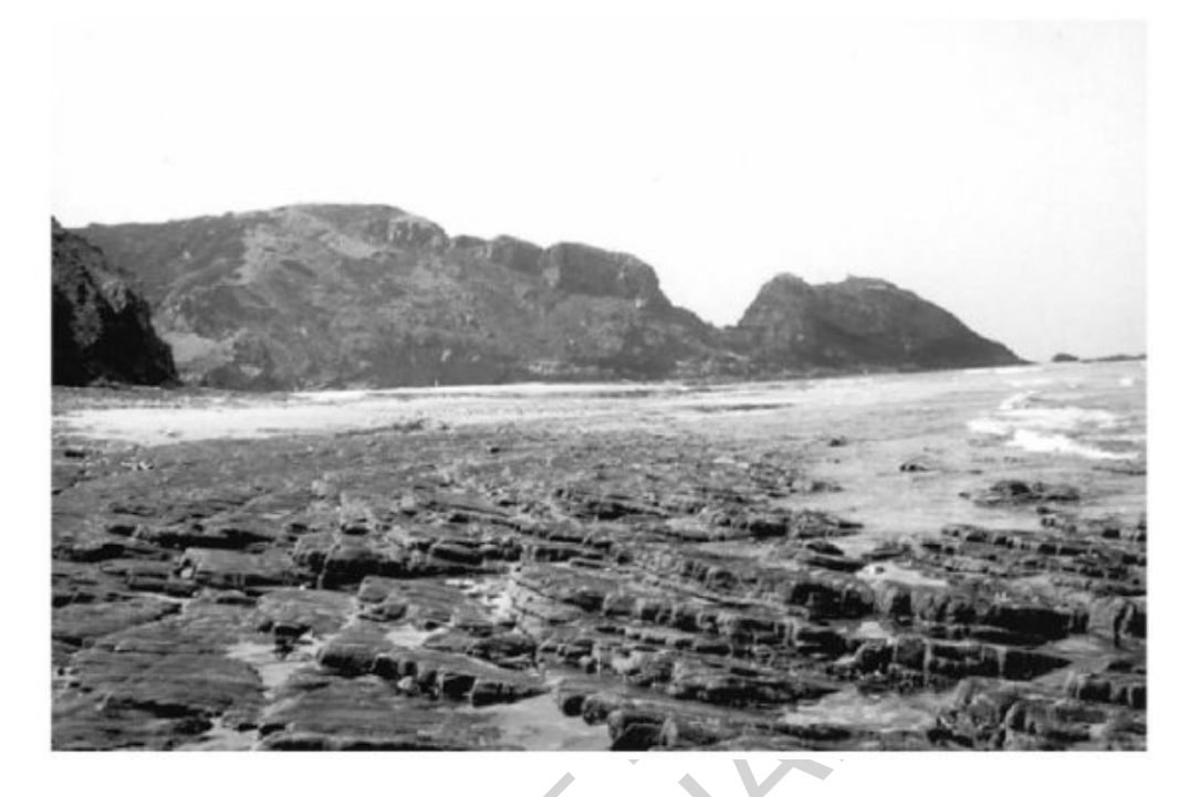
Figure 4. Shore platform associated with a cliff, Alentejo coast, Portugal

The platform extends without significant topographic break, from the base of the cliff to the nearshore sea floor below low-tide level (see Figure 4).