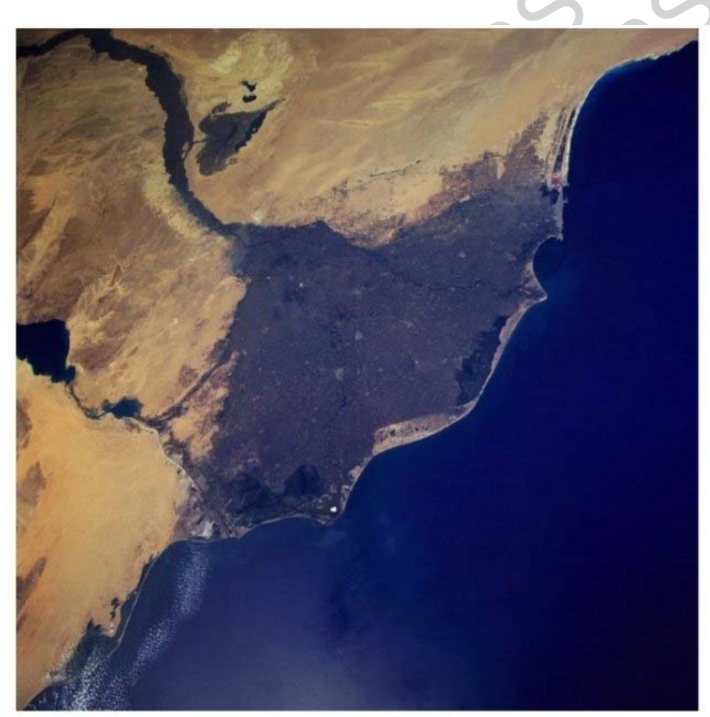
Figure 1. U.S. Space Shuttle photograph of the Nile delta in Egypt showing the river channel and floodplain entering the delta from the upper left. The vegetated area of the delta (dark blue) contrasts sharply with the desert sands (yellow) of adjacent areas of Egypt. The Mediterranean Sea is located in the lower right of the image.

dissolved ions delivered by rivers to a basin. In most cases this basin is the marine environment, although deltas can form along lake margins or even in inland basin areas, such as the Okavango (Botswana). Deceleration of the unidirectional river flow entering the ocean results in a reduced ability to carry sediments, causing rapid deposition on the continental shelf adjacent to the river mouth. River discharge points into the ocean often remain stable for millions of years, resulting in sediment accumulations that can reach 15 to 20 km in thickness. These enormous volumes of material are accommodated on the margin because the great weight of sediments deforms the underlying crust of the Earth and generates internal sediment compaction. The resulting subsidence in deltaic areas partially balances the input of new sediments. Deltas are among the most dynamic of Earth's environments, as the zone of active sediment deposition migrates in response to changing sea level, subsidence, and the interplay between constructive processes, such as river sediment supply, and destructive processes (e.g. tidal currents, ocean waves) that erode the delta front.