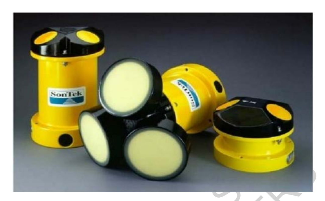
Figure 2. Different acoustic Doppler profilers ADP (with kind permission of SonTek Inc., San Diego).