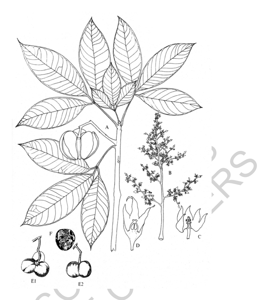
Figure 1. Hevea brasiliensis or Para rubber (Legend: A: shoot with dehiscing fruit; B inflorescence; C: male flower cut open; D: female flower in longitudinal section; E1-2: fruits; F: seed).(Courtesy Purseglove, 1977)

Flowers are borne in many-flowered, axillary, shortly pubescent panicles on the basal parts of the new flush. Flowers are small, scented, unisexual and shortly-stalked, with larger bell-shaped female flowers at the terminal ends of main and lateral branches, and more numerous smaller male flowers, with 60-80 males to each female flower. Flowering takes place over a period of about two weeks with some male flowers opening first, lasting for one day and then dropping, followed by female flowers open for 3-5 days; the remainder of male flowers then open.