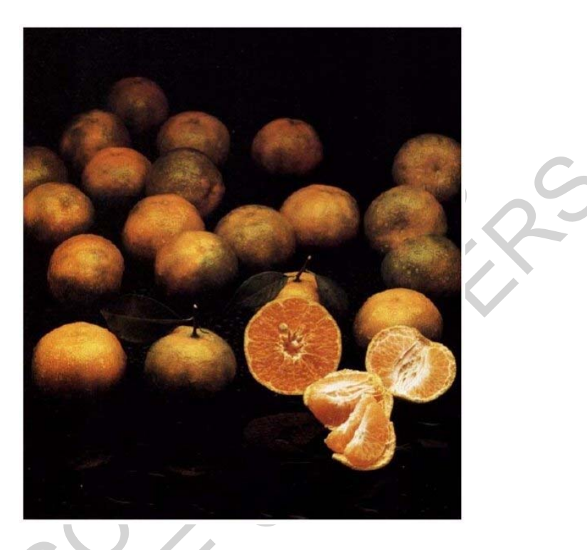
Figure 2. Mandarin fruits

Tangerines are orange-fruited cultivars. Emperor is grown at low altitudes in Kenya. Satsuma is very hardy and cold resistant; Kalimpong, Sylhet, and Coorg, which are small, deeply colored and intensely flavored, are grown is India. Mandarin pulp is eaten fresh as a desert. Segments are also canned and used in the production of mandarin juice.