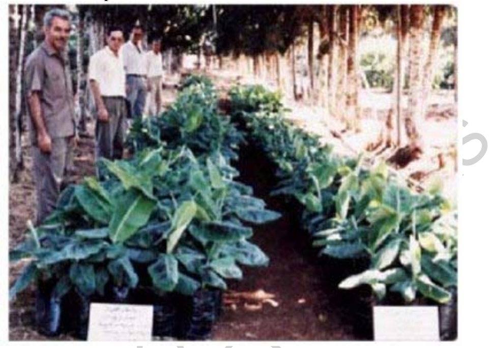
Figure 1. Banana propagation in research station

The banana is grown in all tropical and some subtropical countries, e.g. Lebanon, Spain. The world area under banana cultivation is about 3million hectares; the average yield is 13 tons per hectare. World production of banana exceeds 40 million tons. About 20% of bananas are raised for export.