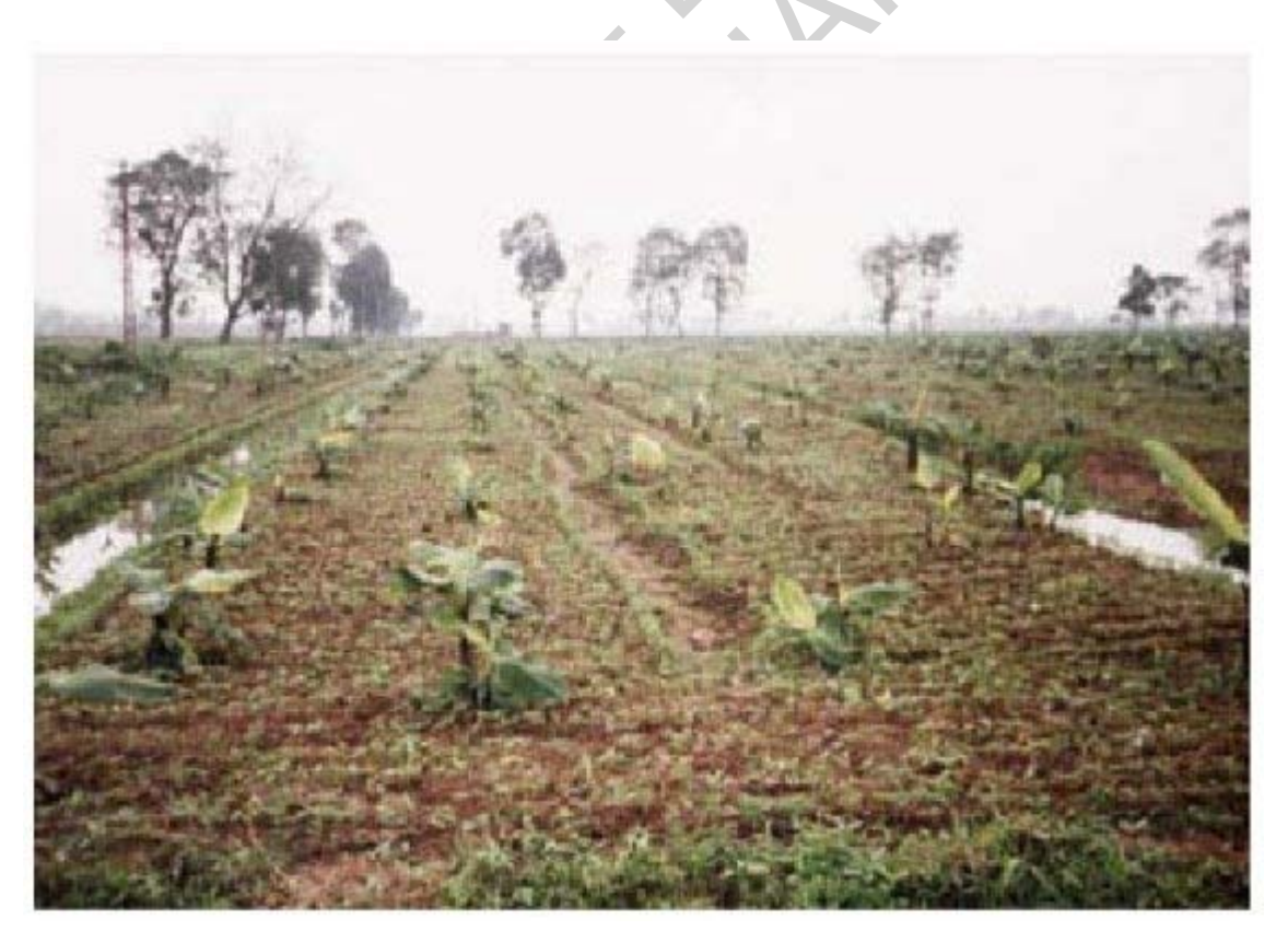
Figure 2. Banana plantation

Ripe fruit are not transportable. Green fruits are usually transported as whole composite fruits packed in polyethylene or paper bags at temperatures strictly maintained for each variety (11 to 13 ^{\circ} C) and at high air humidity (see Figure 2).