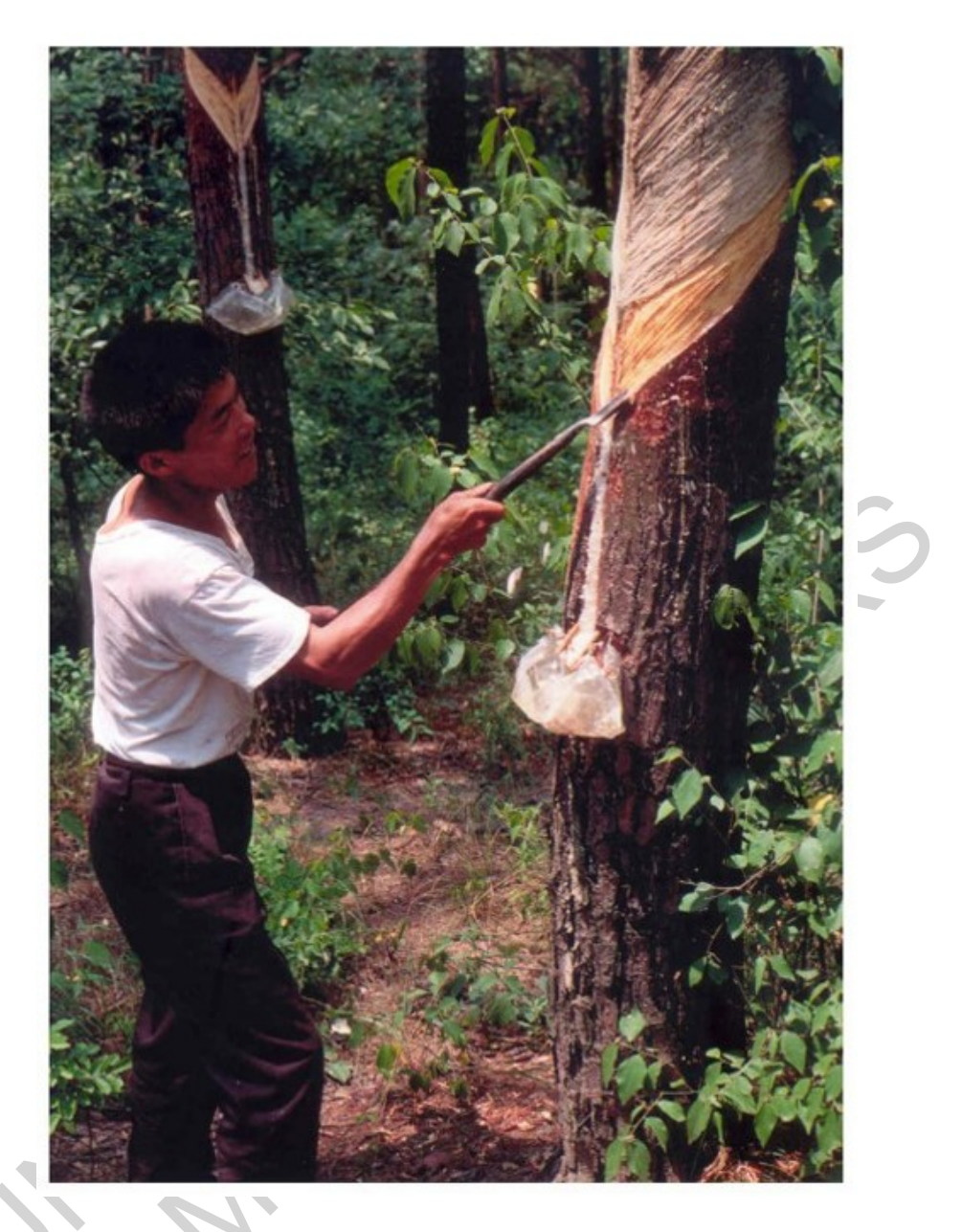
Figure 2. A worker in Anhui Province, China, makes fresh wounds on a Masson pine, Pinus massoniana , to stimulate resin flow.

Resins are classified according to their hardness and chemical composition into oleoresins and hard resins. Oleoresins are sticky, amorphous liquids that contain essential oils. Hard resins are hard, brittle, odorless and tasteless and exhibit a glasslike character. They are obtained either as fossils or as distillation products of oleoresins.