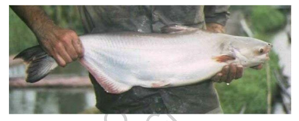
Picture 2. Broodfish of Pangasius bocourti (Pangasiidae) stocked in pond in Viet Nam.