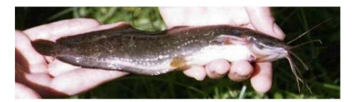
Picture 1. Food Clariid from pond culture in Viet Nam, hybrid between female Clarias macrocephalus and male Clarias gariepinus .