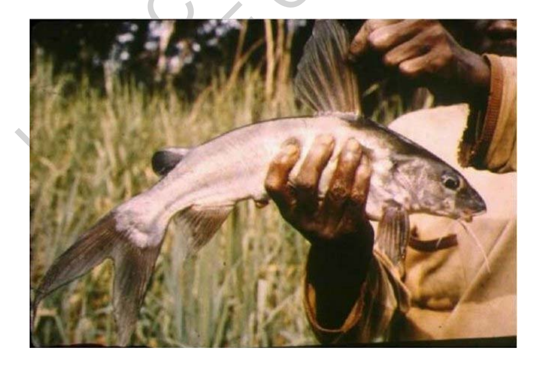
Picture 3. Food Chrysichthys nigrodigitatus (Bagridae) cultured in pen enclosure in Niger (Picture from Mr. Saurin Hem, IRD, France).