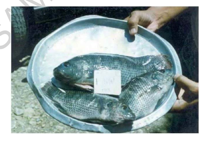
Figure 2. Nile tilapia (Oreochromis niloticus.)

Tilapias grow to maturity in less than four months in the tropics. Breeding of tilapias can also occur throughout the year. Male tilapias grow faster than the females and are known to grow up to a size of 3 kg or more. Culture of tilapias is done in ponds, tanks and net cages in freshwater, brackishwater or seawater. The Nile tilapia (see Figure 2) is the most important species for freshwater culture while the Mozambique tilapia is the most salt-tolerant.