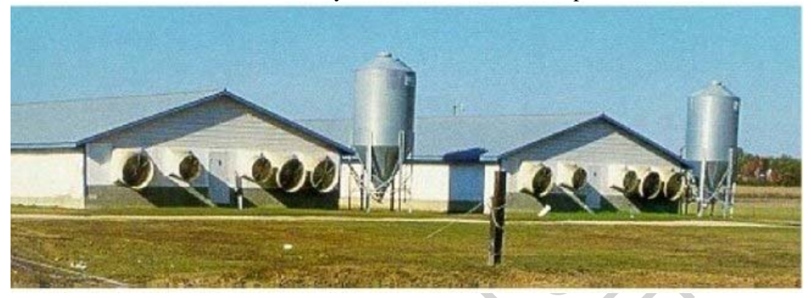
Figure 3. An example of ventilation fans in a swine facility. Fans for each building have a ventilation capacity of approximately 50 \text{ m}^3 \text{h}^{-1} .

the animal buildings. The ultimate purpose of ventilation is to supply fresh air to, and meet the heating/cooling requirements of, animals and humans in the building. It fulfills this purpose by bringing fresh air into the building airspace to replace and dilute the heat, moisture, toxic gases, and contaminants that eventually build up indoors. The ventilation fans (Figure 3) deliver thousands of cubic meters of air per hour according to the climatic conditions. The fans are automatically controlled, some are computer remote controlled.