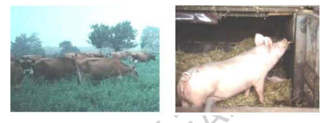
Figure 1. Livestock have been traditionally raised outdoors as a family business. The equipment needed for such production is minimal: (a) dairy cows wandering on grassland with no equipment except for milk production; and (b) pigs are raised in a backyard shed, fed with leftovers using minimal equipment.

Traditionally, raising livestock was a family business and animals were often raised outdoors (Figure 1). Cattle strolling and grazing on open grassland, chickens running around and picking up feed and insects, and pigs rooting in the dirt and eating food scraps in a backyard or a shed were common sights. In such traditional systems, facilities and equipment for raising animals are minimal and the management activity is trivial. It is often a household business and only requires part-time labor. In many parts of the world today, such traditional production systems still exist and serve as the main means of meat, eggs and milk production. But in this book, facilities and equipment for livestock production are primarily devoted to large-scale intensive housing systems.