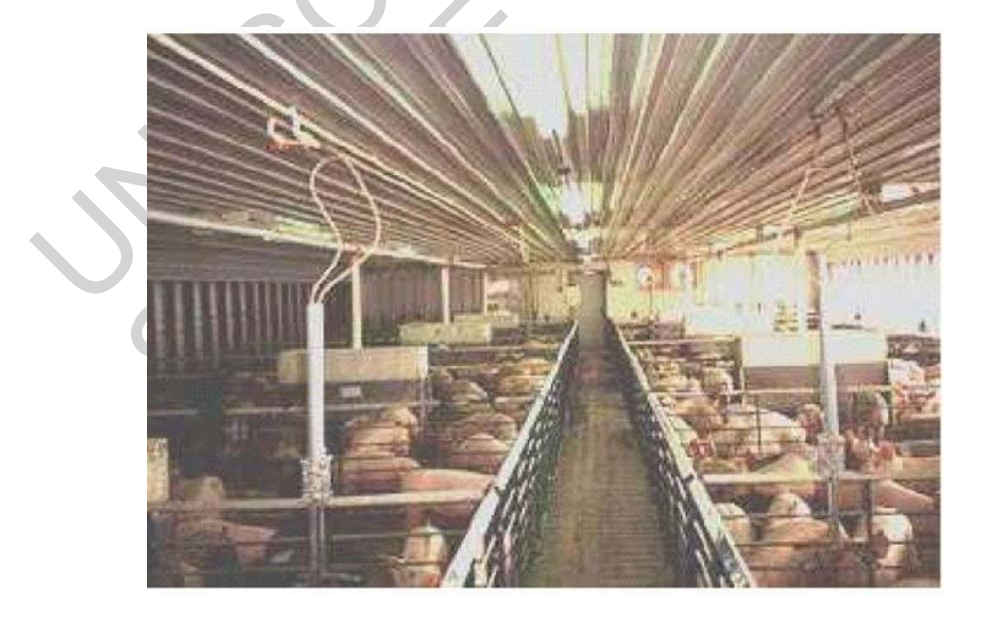
Figure 2. A typical swine production room in today's pork industry. Thousands of animals are housed in an environmentally-conditioned indoor space containing many rooms. A typical swine facility may include tens of thousands of pigs and cost millions of dollars to construct.