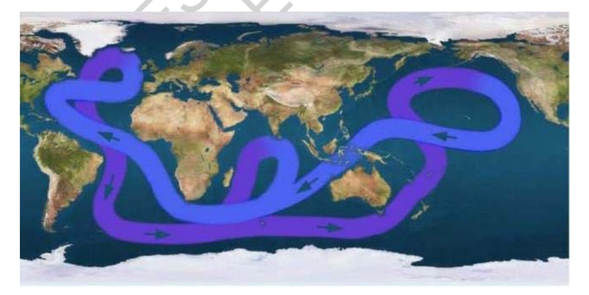
Figure 2. Map showing simplified large-scale "conveyor belt" thermohaline circulation of ocean water. Lighter blue color indicates surface water movement, while darker blue band shows deep ocean circulation.

When oceanic thermohaline circulation is disturbed, climatic repercussions are felt on adjacent continental regions. It is believed that changes in North Atlantic Deep Water (NADW) production occurred regularly during the Quaternary. During glacial periods, sea-ice extended much farther south than present, preventing the northward penetration of warm shallow currents and limiting or shutting off NADW production. During times of rapid melting of continental ice sheets, there were significant inputs of cold, fresh water to the North Atlantic. The freshwater layer was less dense than seawater, preventing overturn of the water, which also may have interrupted formation of NADW. In either case, lack of warm, moist air enhanced cooling in continental regions adjacent to the North Atlantic. Numerous episodes of abrupt, rapid, cold-warm cycles, in which temperature changes of as much as 10°C occurred over a few decades or less, are recorded in Greenland ice-cores. The Younger Dryas cold interval is the most recent of these events in which continental and ice-core records indicate sudden cooling accompanied by a rapid return to full glacial conditions in northwest Europe, interrupting deglacial warming around 12-11 ka B.P. These brief cyclic episodes are hypothesized to result in part from disturbances to the oceanic conveyor belt and shutting off of NADW formation (See: Thermohaline Circulation).