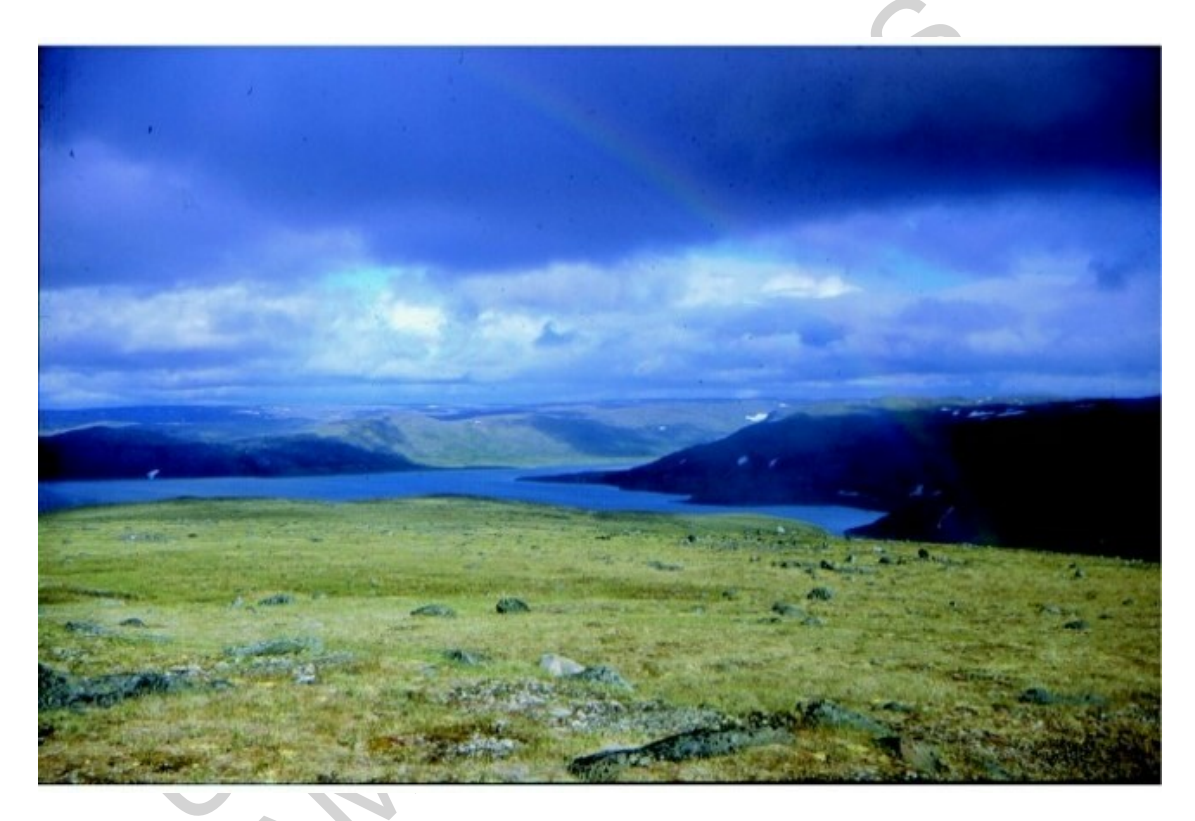
Figure 1. A tundra landscape in northern Canada.

The very short growing season, coupled with shallow soils and the prevalence of cryoturbation and solifluction, inhibits tree growth and the vegetation consists of low-growing woody herbaceous perennials, grasses, sedges, mosses, and lichens.