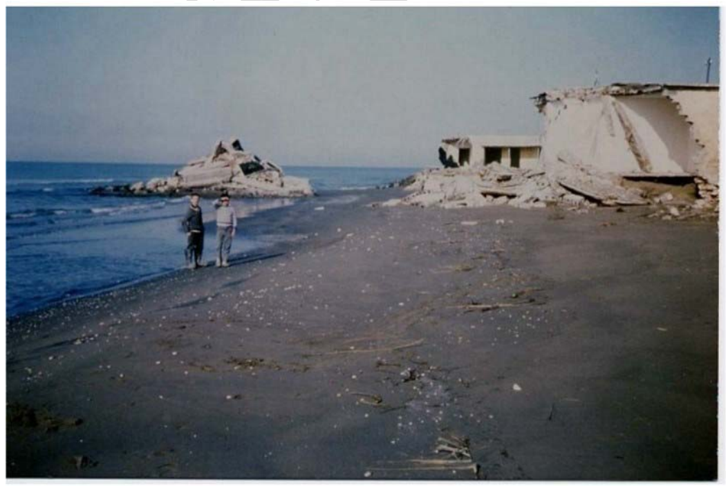
Figure 2. Beach erosion and encroaching sea on the deltaic coast of the Seman River, Albania

Lateral erosion may be often the dominant mode of land loss when sea level is rising. Offshore sediment supply is depleted since the culmination of the postglacial transgression and fluvial sediment supply has been curtailed as a result of dam construction in recent times.