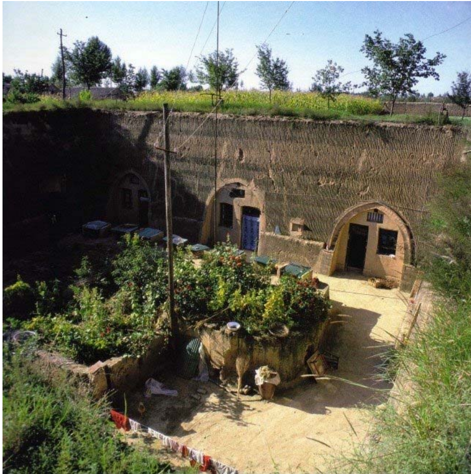
Figure 3. Superposed objects: agriculture on top of housing in China

The third possibility is the case of mixtures in time: the frequent case of succession of crops, for example. In that case, some rules in terms of date of observation or rules concerning the main commercial value of crops may be applied. Fallow land (Figure 4) is a typical issue in the observation of arable land observation.