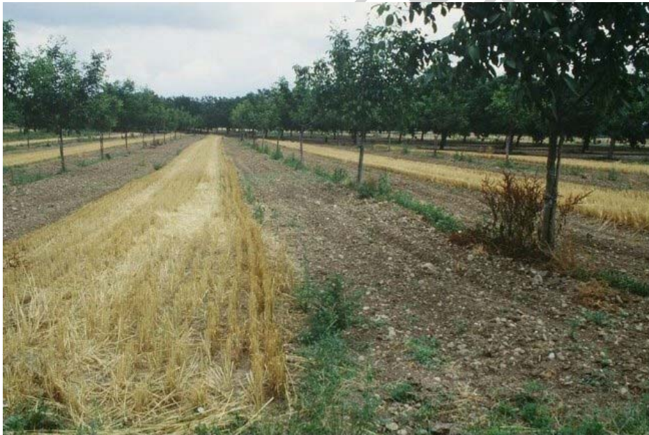
Figure 2. Juxtaposed objects: nuts trees and wheat in France

The second case is the possibility of having mixed objects by “superposition.” This is the case of the superposition of various land uses in a building or the typical problem of crops under cover. In that case, the distance of observation has no impact but decisions are to be made. Superposition is illustrated in Figure 3 with a particular case where agricultural use on top of residential use may be found. In general, pro-rata or dominance rules are applied for superposed objects.