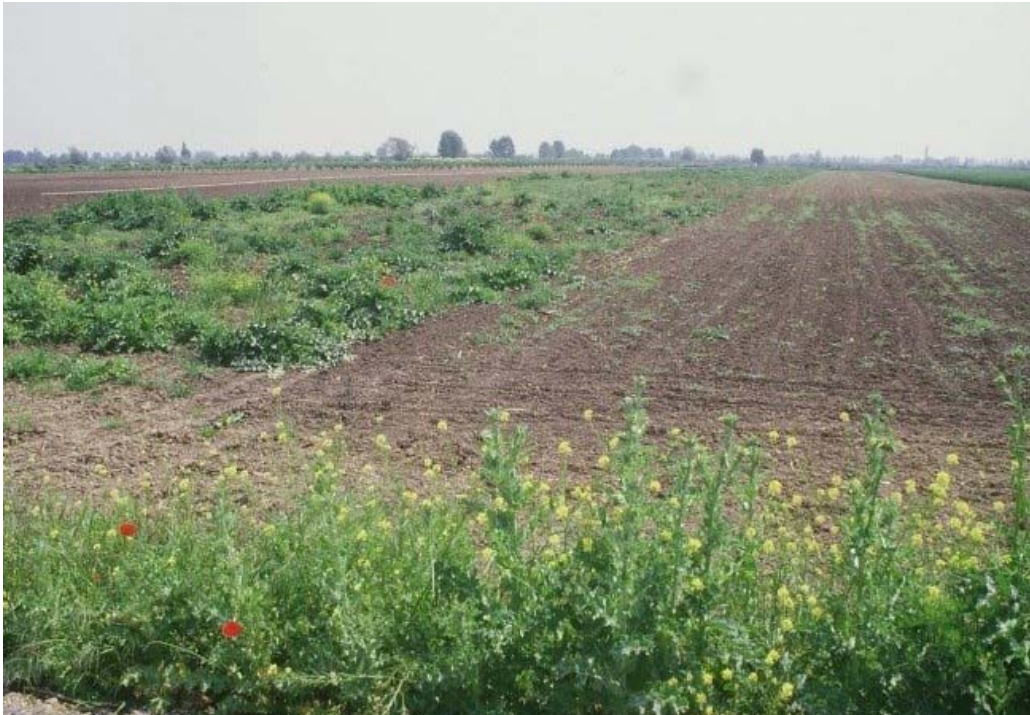
Figure 4. Variation of covers in time: fallow land

In general, applying the pro-rata rule (or, to a certain extent, the dominance rule) has considerable advantages. From a statistical point of view it is important to be able, for example, to count all areas covered by meadows and pastures including areas where meadows may be found under tree cover. From a cartographic point of view, this rule has the advantage of limiting the number of classes in the key map. From a thematic point of view, it is important to be able to describe areas where agriculture and forest may be found on the same area.