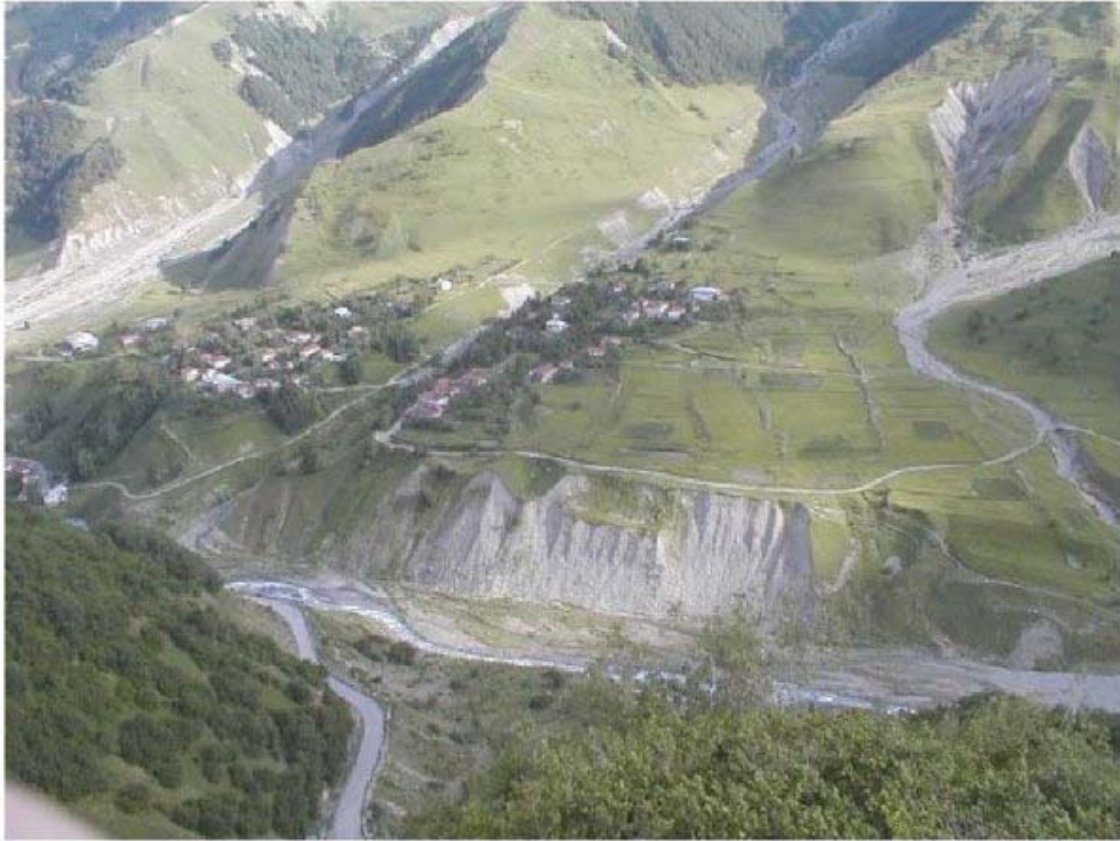
Figure 3: In Georgia loss of winter grazing has reduced grazing pressures and erosion.