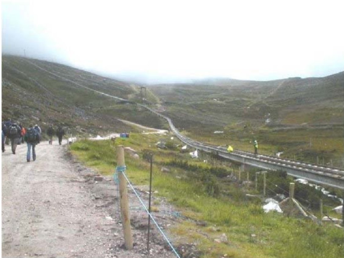
Figure 2: New funicular railway being built at Cairngorm, Scotland, has resulted in strong conflicts of interest with nature conservationists because of possible increases in use of adjacent mountain summits.

While these different types of protected areas will receive some protection from possibly damaging operations, they can also result in conflicts of interest with other land uses, and many owners regard designation as reducing the potential value of their land through constraints on development. The protection of wildlife can also result in conflicts of interest, particularly between farmers and those wanting to conserve carnivores and raptors that can prey on farm livestock or damage crops.