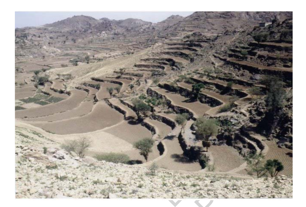
Figure 2. Beautifully built terraces in Yemen carefully maintained over the centuries

Great interest has been shown in these traditional soil-conservation systems in recent years and a number of studies have been conducted to find out more about them and if they can be adapted to present day conditions.