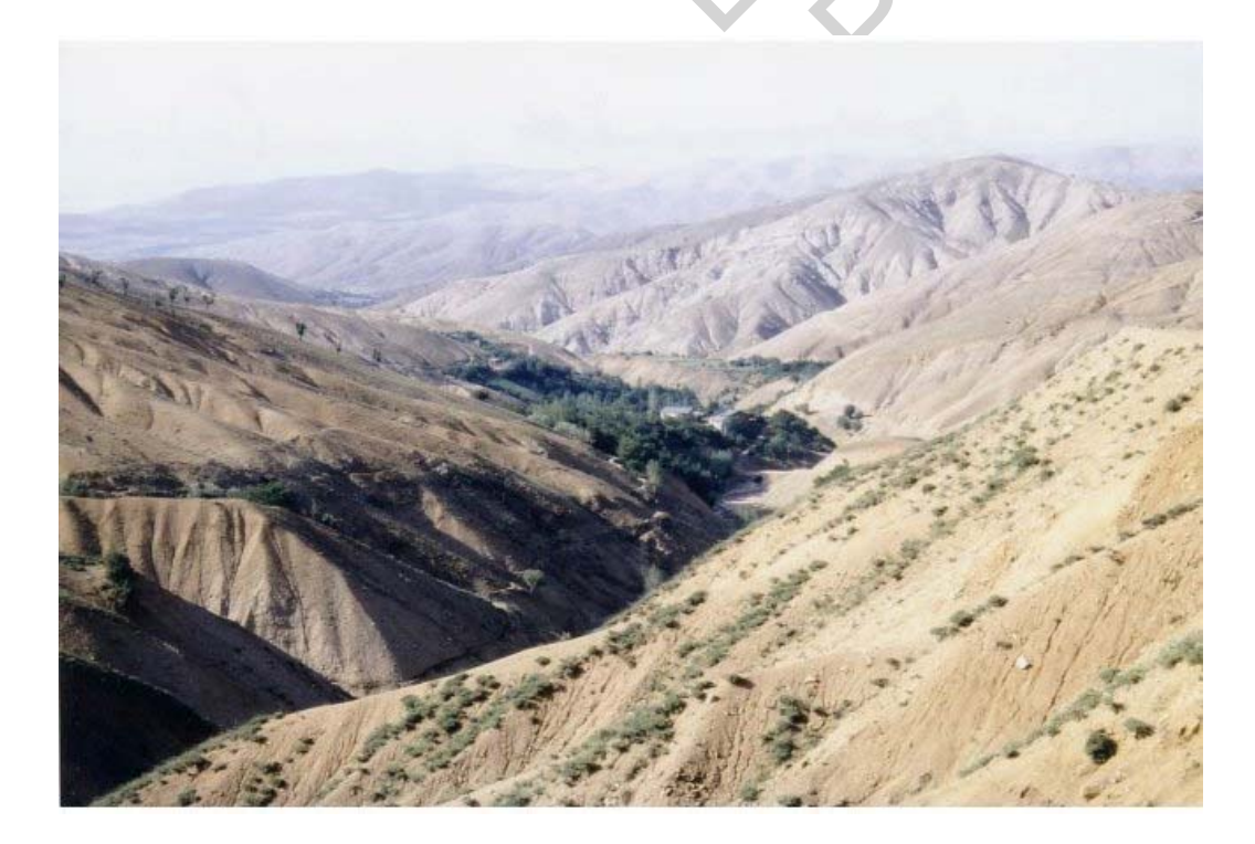
Figure 1. Badly eroded hills in northeastern Turkey, cleared of their natural forests and heavily overgrazed

Under natural conditions, different environments evolve which vary according to the available variety of plants and animals and the existing soil, climate and topographic conditions. These environments exist in a state of dynamic equilibrium, a state where they are usually able to adjust and recover after some unusual event such as the outbreak of a disease, a fire, or a drought. Wherever humans have settled and cultivated and grazed the land with their domesticated animals, these conditions have been upset and changed. In some places, and over time, new forms of land use have evolved which are in harmony with the soil, climate, and topography and a new, productive, and stable environment has been established. Unfortunately, this has not always been the case and over large areas of the world's surface land use systems are to be found which are not in balance. Where this is the case, various forms of land degradation are taking place.