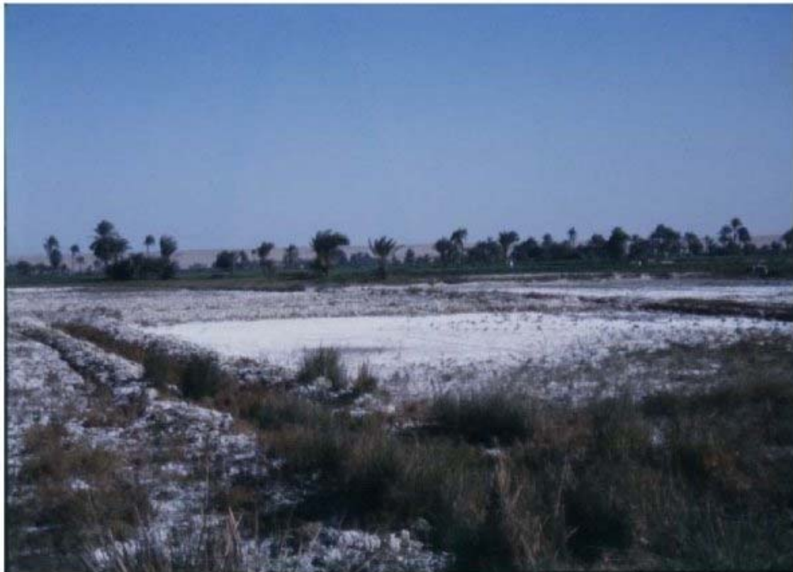
Figure 1. Surface salinization in Egypt.

The soil solution of a salty soil mainly contains cations like \text{Na}^+ , \text{Ca}^{2+} , \text{Mg}^{2+} and \text{K}^+ and anions like \text{Cl}^- , \text{SO}_4^{2-} , \text{HCO}_3^- , \text{CO}_3^{2-} and \text{NO}_3^- . The dominant cation in salty soils is \text{Na}^+ , which usually exceeds the concentration of \text{Ca}^{2+} and \text{Mg}^{2+} . The predominant anions are \text{Cl}^- and \text{SO}_4^{2-} and some \text{HCO}_3^- at normal pH values of 6 to 8, while \text{CO}_3^{2-} is found at pH above 8.5.