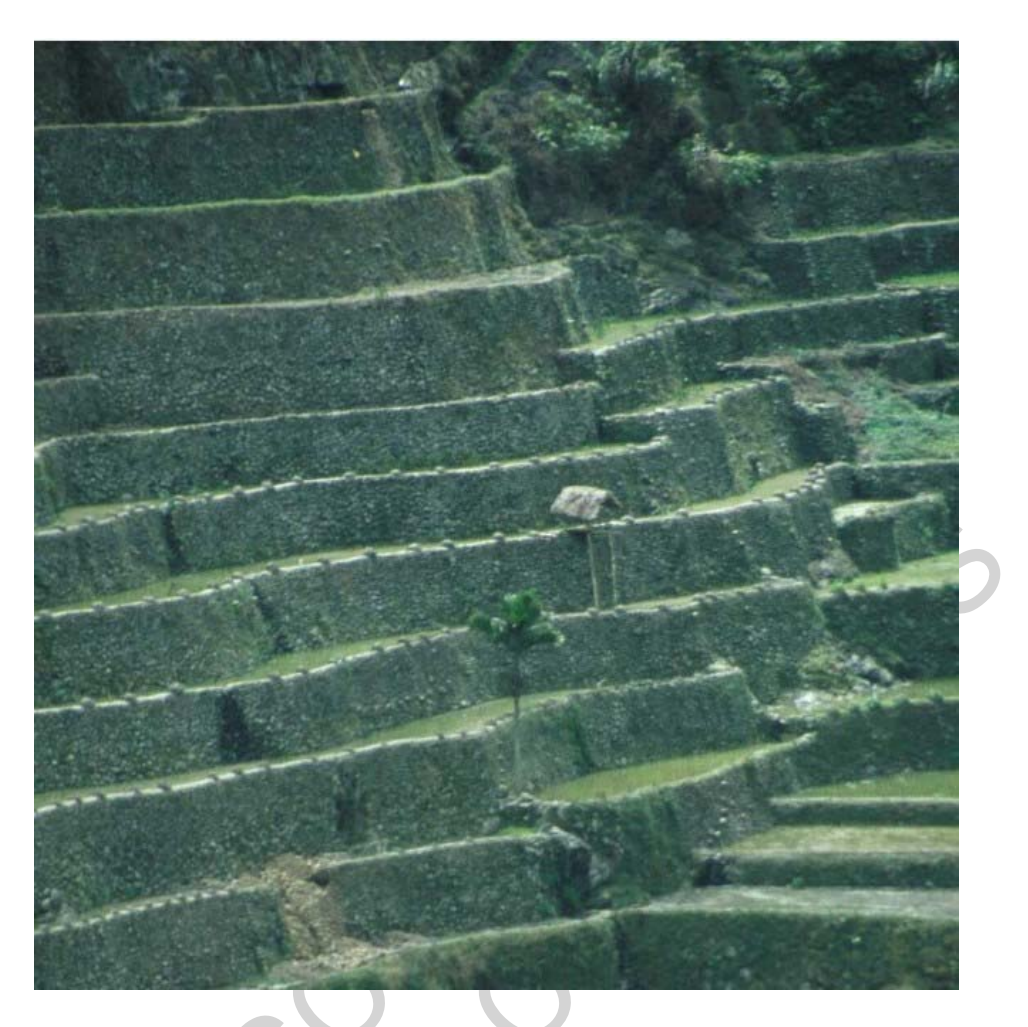
Figure 3: Impression of the typical stone-walled rice terraces around Batad/Ifugao in Northern Luzon/Philippines; ( Picture: J. Settele )

However, population growth, improved education, and hope for better living conditions in other regions are causing drastic changes. Documentation of the traditional system and analysis of its ecology was the aim of recent research within the system (see bibliography for examples). These, together with investigations on the effects of changes of agricultural practices, form the basis for recommendations to direct developments in order to continue sustainable use of those ecosystems in the future. This contribution summarizes the present state of knowledge and, derived from that, tries to deduct some general conclusions for future management policies.