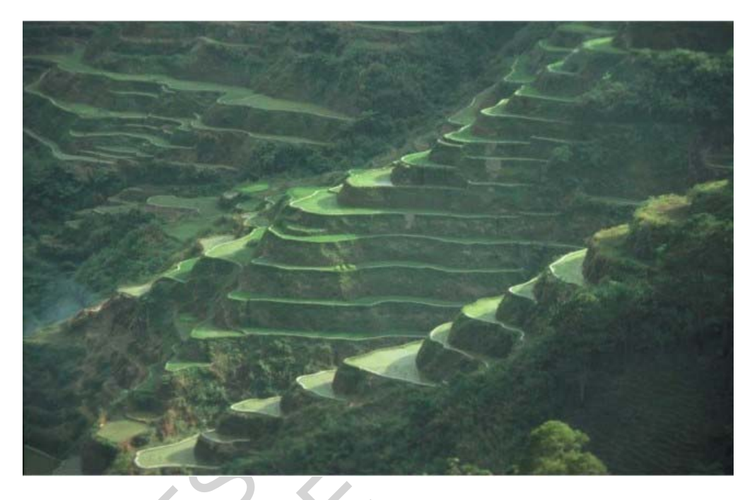
Figure 2: Impression of the typical clay-walled rice terraces around Banaue/Ifugao in Northern Luzon/Philippines; ( Picture: J. Settele )

Due to the dominance of irrigated rice crops, this contribution will entirely focus on them as the most relevant representative in the context of inland wetlands. Furthermore, to show the interactions of management and biodiversity, which also includes many socio-economic, cultural, and thus historical aspects, the contribution will concentrate on one integrative case study where all the different aspects and consequences of future management scenarios can be exemplified. For this purpose (and due to the long-term experience of the author) the rice terraces of the Philippine province of Ifugao have been selected. As they are flooded throughout the year they also represent real (humanmade) inland wetlands.