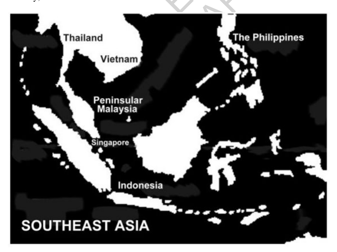
Figure 1:Location of Peninsular Malaysia in Southeast Asia