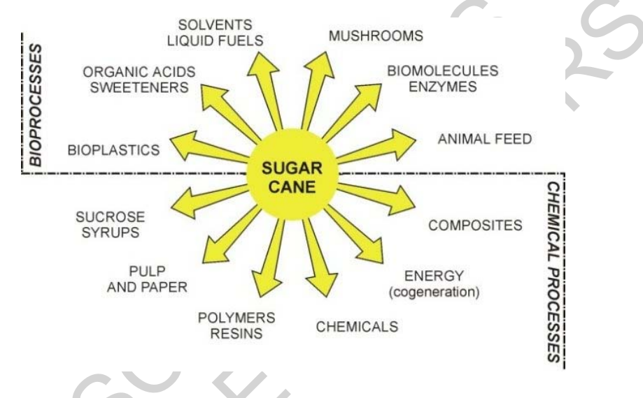
Figure 2: Utilization of sugarcane in chemical and biotechnological Processes

For the sake of a better understanding of the applications of the above mentioned techniques, several examples of contemporary biotechnology can be used to illustrate how these physical methods of analysis are useful to collectively monitor, analyze, and quantify all steps in the pretreatment, hydrolysis, fermentation and upgrading of natural goods such as sucrose (sugar cane juice and molasses), starch (from cereals like corn and wheat or from tubers like potato or cassava), cellulose and hemicellulose (sawdust from timber mills or husks from cereals) to their final products such as yeast biomass (MBP, Microbial Biomass Protein for animal feed), ethanol (fuel for more environmentally friendly vehicles), and oxygenated carotenoids (for fish farming and poultry). In this chapter, the bioconversion of sugar cane has been chosen as an example because this plant biomass provides both a soluble (sugar cane juice) and an insoluble (sugar cane bagasse) substrate for fermentation (Figure 2). Therefore, analytical problems related to both strategies can be adequately demonstrated and discussed.