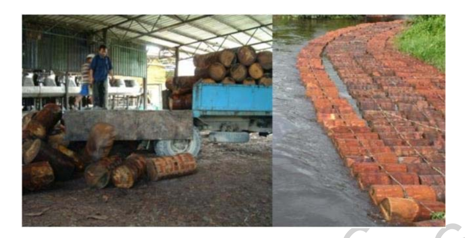
Figure 3: Sago logs are transferred using lorries or as sago rafts to sago mills.