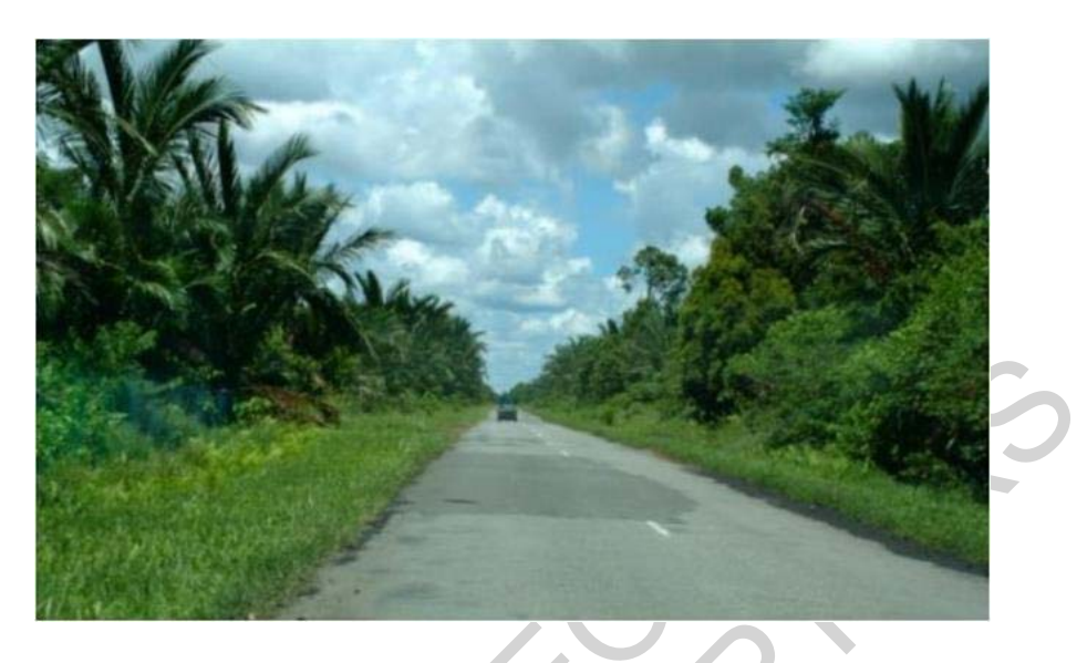
Figure 1: Large sago plantations like this are a common sight in Sarawak, Malaysia

develop from these suckers, thus assuring a continuous supply of fresh logs. Apart from unknown serious pests, sago palm is the only starch crop that thrives and grows with minimum care in swamp areas.