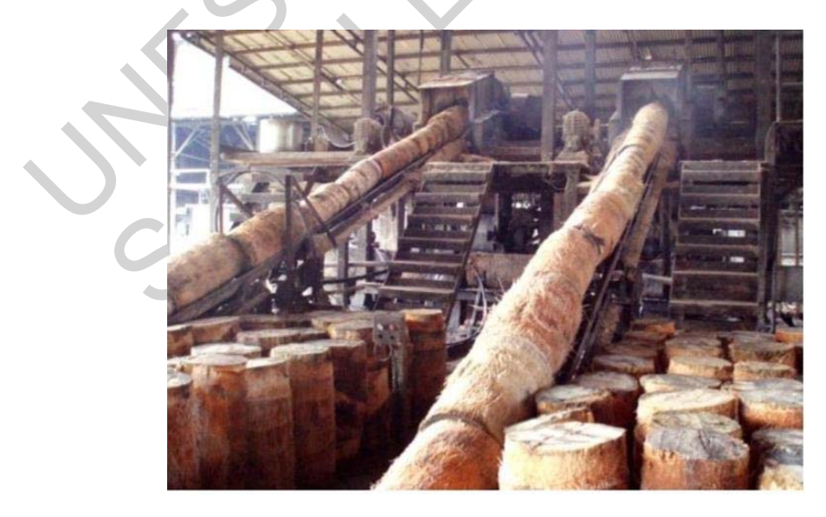
Figure 5: The pathway of sago starch processing at Nitsei Sago Mill Pte. Ltd., Mukah, Sarawak