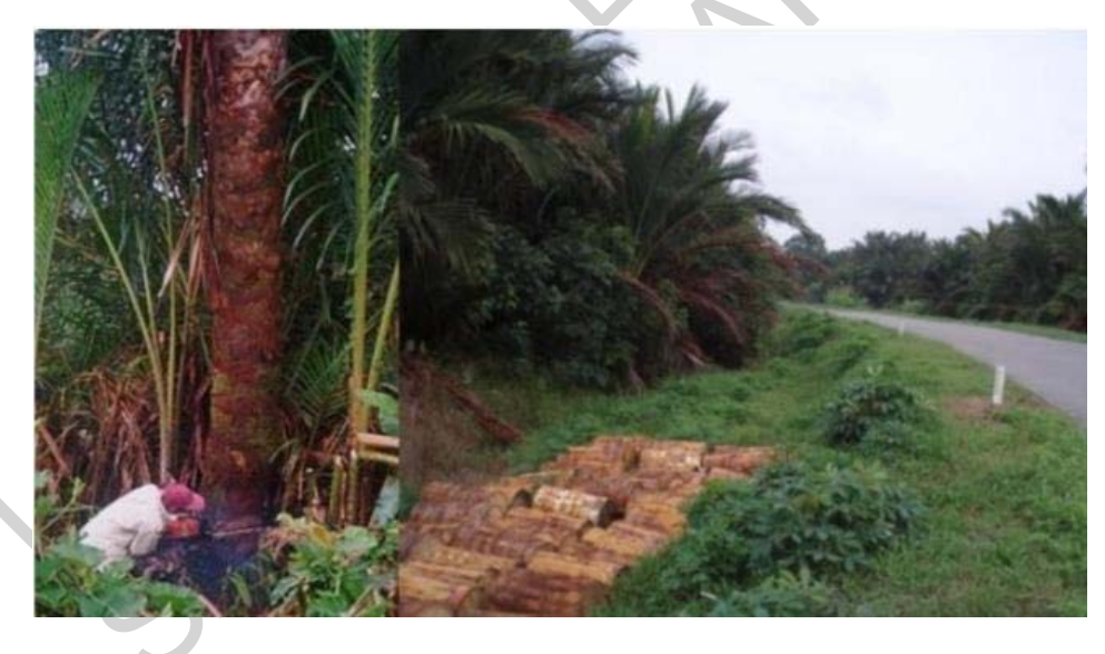
Figure 2: Harvested sago logs awaiting collection

The sago trunk is cut into 1m logs (Figure 2), which are transported to the sago mill using lorries, or tied to form rafts (Figure 3). The log is protected by a hard and thick bark (about 2-3cm), which is debarked manually or using debarking machine (Figure 4). The debarked logs are mashed using a rasper (Figure 5) followed by hammer mill, then water is added to form starch slurry. The detail of this process is shown in Figure 6. Depending on the efficiency of the extraction system used, it takes less than an hour for the dried sago starch to be produced (Figure 7), from rasping of the pith to final flash drying of the starch slurry.