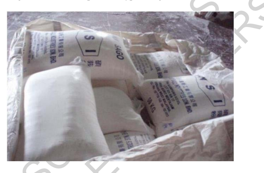
Figure 7: Bagged sago starch ready for export.

A typical sago mill consumes about 1,900 to 2,000 logs per day, producing 20 tons of food grade sago starch. The amount of starch per log has been estimated to be about 20% of the fresh weight of each log and each log typically weights between 100-130kg.