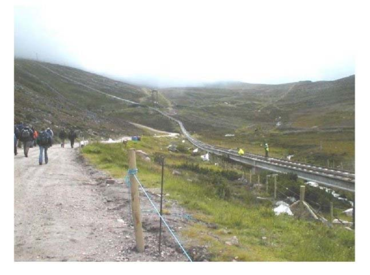
Figure 2: New funicular railway being built at Cairngorm, Scotland, has resulted in strong conflicts of interest with nature conservationists because of possible increases in use of adjacent mountain summits.

While these different types of protected areas will receive some protection from possibly damaging operations, they can also result in conflicts of interest with other land uses, and many owners regard designation as reducing the potential value of their land through constraints on development. The protection of wildlife can also result in conflicts of interest, particularly between farmers and those wanting to conserve carnivores and raptors that can prey on farm livestock or damage crops.