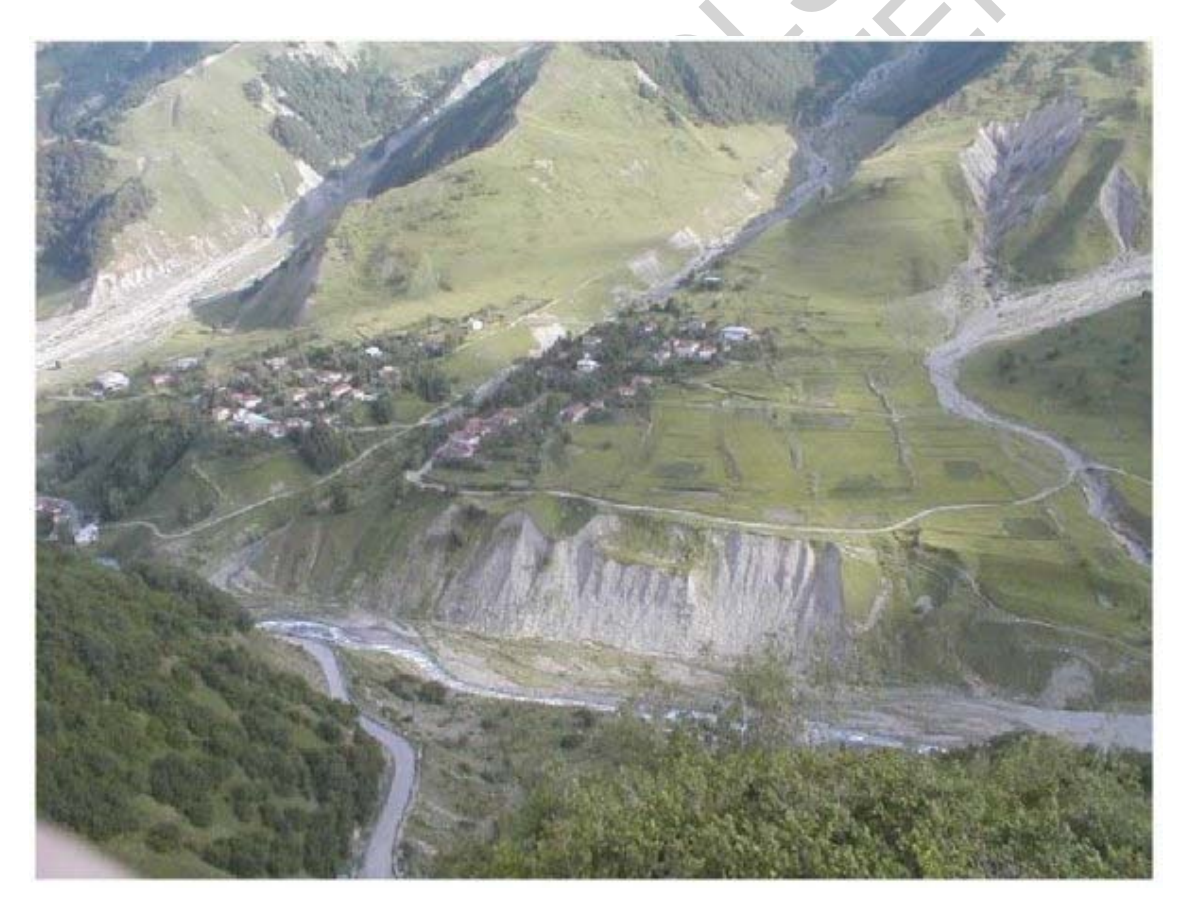
Figure 3: In Georgia loss of winter grazing has reduced grazing pressures and erosion.

Major changes in national borders and land ownership have occurred over time in many parts of the world. In Georgia, for example, the borders with the Russian Federation have been largely closed since the country became independent. In the Kasbegi area this has meant loss of tourists, winter grazing for the previously large sheep flocks, and the