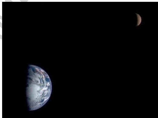
Figure 1. The Earth-Moon system (Credit NEAR Spacecraft team)

A new type of object, namely a Satellite: - the Moon, was also recognized for the first time. This, for the time being at least, made the Earth an anomaly amongst the planets as it was the only planet with a moon.