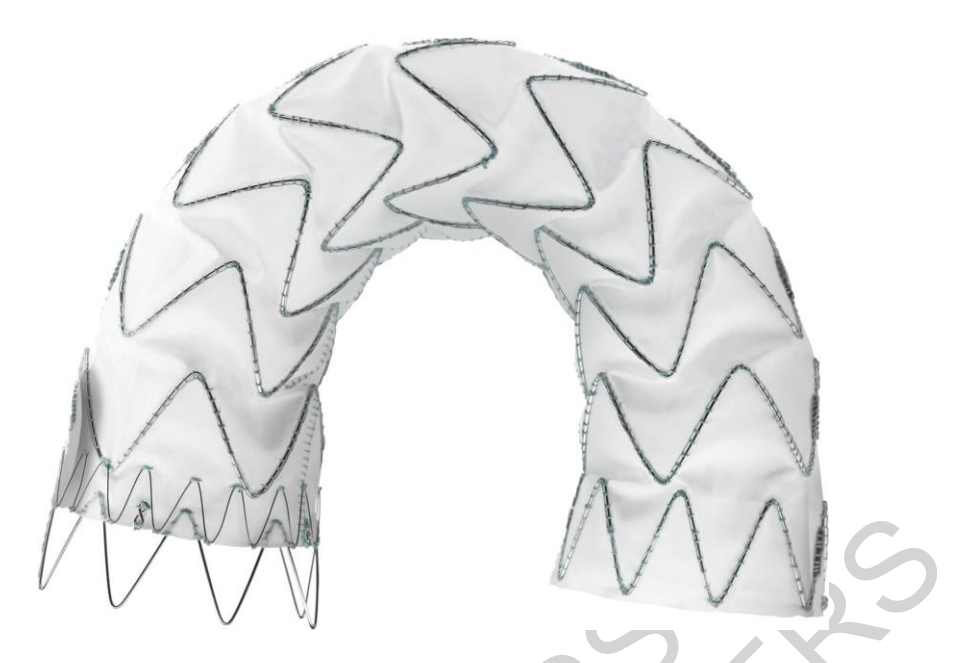
Figure 1. Medtronic Valiant Thoracic Endoprosthesis, Courtesy of Medtronic Corporation

THE PREVENTION AND TREATMENT OF CARDIOVASCULAR DISEASES - Endovascular \,Repair \,of \,the \,Thoracic \,Aorta - Frank Manetta