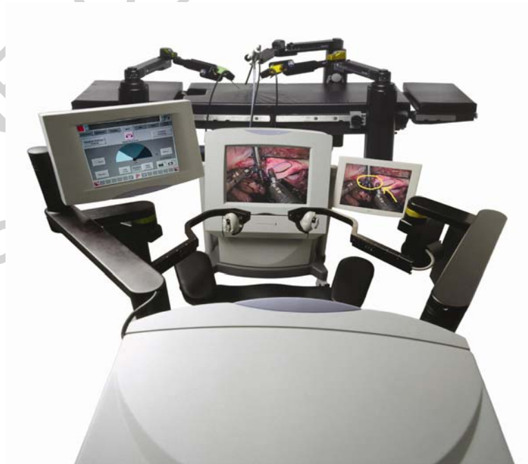
Figure 2. The Zeus robotic system and master unit.