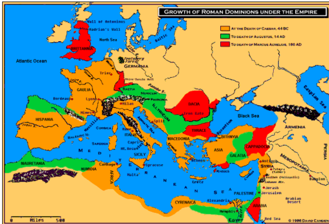
Figure 1. Growth of Roman Dominions under the Empire

The bulk of these territories were acquired through Roman triumph in the three Punic wars against Carthage (264-241BC; 218-201BC and 149BC) and the accompanying wars against Greek kingdoms, making the Mediterranean a Roman ‘Mare Nostrum’ by the start of the first century BC. Julius Caesar’s Gallic campaigns in the middle of that century brought most of Gaul (roughly, today’s France) under Roman rule, paving the way for the conquest of Britain in 43 AD. Thereafter, Roman power was only substantially extended into Dacia (mostly contemporary Romania) in 105-6 AD and, after the Parthian wars of the late second century AD eastwards as far as the Tigris. In addition to these conquered provinces, Rome also established a number of client kingdoms in the course of its expansion, including Armenia, Mauretania, Thracia in the contemporary Balkans, and Cappadocia in eastern Anatolia.