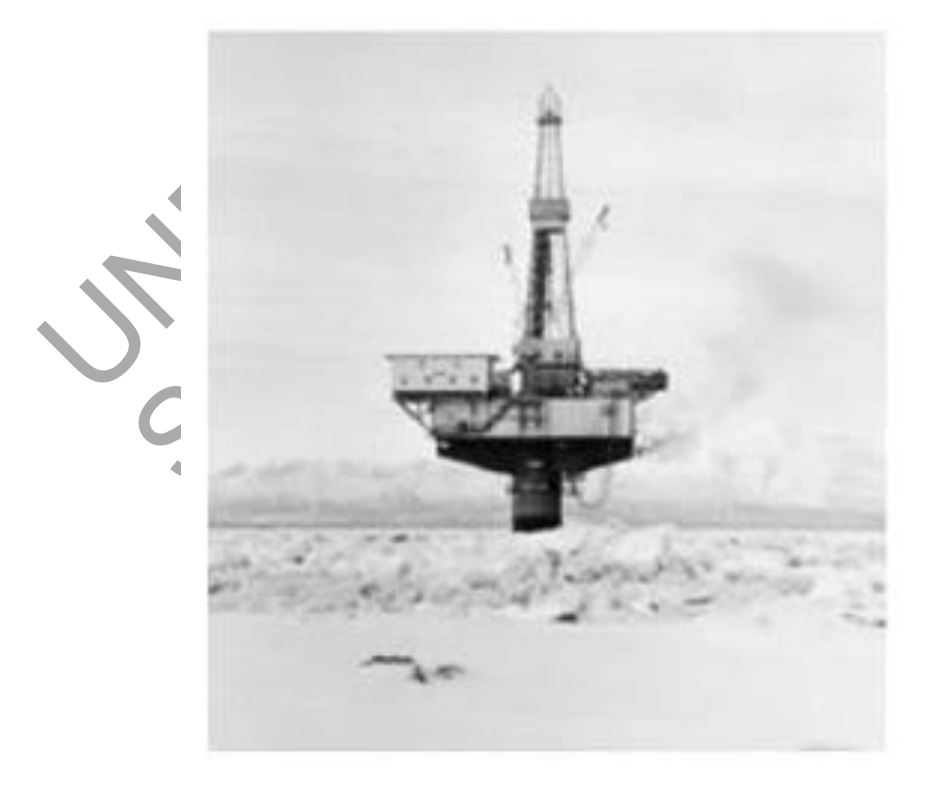
Figure 1. Monopod "Trading Bay"