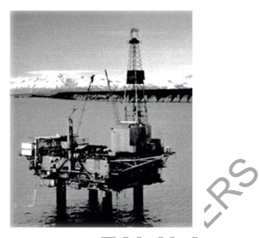
Figure 2. Four-legged platform "Bruce"