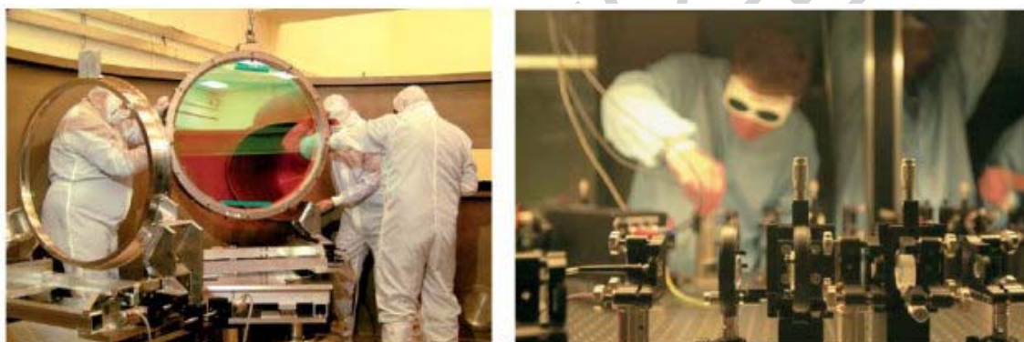
Figure 1. Left : Giant single pulse VULCAN laser. Right : High-intensity Jena tabletop laser.

With the help of modern compact high-intensity lasers (Figure 1), it is now possible to produce highly relativistic plasma in which nuclear reactions such as fusion, photo-nuclear reactions, and fission of nuclei have been demonstrated to occur. This new development opens the path to a variety of highly interesting applications, the realization of which requires continued investigation of fundamental processes by both theory and experiment and in parallel the study of selected applications. The possibility of accelerating electrons in focused laser fields was first discussed by Feldman and Chiao in 1971. The mechanism of the interaction of charged particles in intense electromagnetic fields, for example, in the solar corona, had, however, been considered much earlier in astrophysics as the origin of cosmic rays. In this early work, it was shown that in a single pass across the diffraction limited focus of a laser power of 10^{12} W, the electron could gain 30 MeV, and become relativistic within an optical cycle. With a very high transverse velocity ( u ), the magnetic field of the wave (characterized by the magnetic flux density B ) bends the particle trajectory through u \times B Lorentz force into the direction of the traveling wave. In very large fields, the particle velocity approaches the speed of light and the electron will tend to travel with the wave, gaining energy as it does so.