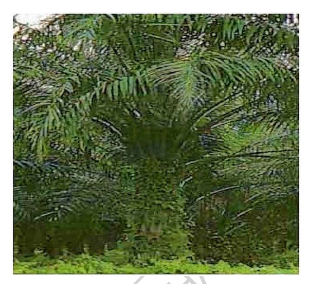
Figure 1. Palm oil trees

After the independence of Indonesia, the palm oil business started to recover again. By 1969, Indonesia produced 180,000 tons of palm oil and around 40,000 tons of palm kernels. The majority of palm oil was exported, and only a small quantity of palm oil was used in the domestic market. As for palm kernels, the total production was exported, as no palm kernel crushing plant had yet been installed in Indonesia, at that time. Until early 1970's, the palm oil cultivation was carried out only by large plantation companies. In 1975, small private companies and farmers came into this business although, their involvement was still limited, because the demand was still low.