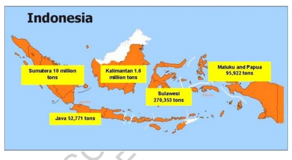
Figure 3. Production of CPO in Indonesia (in tons), year 2005

The RBD olein was introduced into the market as cooking oil to substitute coconut oil. Many house wives favored coconut oil and hesitated to buy the newly introduced cooking oil. However, this was only temporary. The palm oil gained in market share because, besides being used as cooking oil, palm oil was used as vegetable fat not only in foods such as margarine and shortening, but also as an ingredient in a wide variety of products such as soap, shampoo and cosmetics, as an additive for leather and textile industries, as a de-inking agent for paper, and in industrial uses such as anti-friction agents in metal processing.