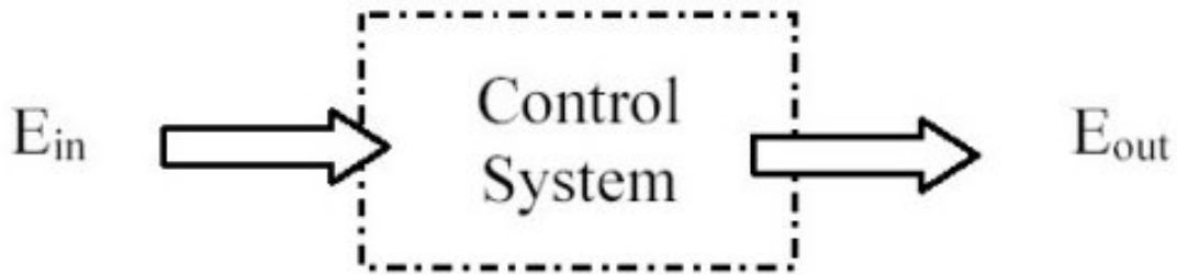
Figure 2: Demonstration of energy flow through a control system

Effective flow of information, including scientific and economic information, among different market sectors is vital for the sustainable operation of a food system. The internet, telephones, radios, televisions, and printed media form a communication network between the key players involved in any given food system. Figure 3 illustrates a simplified diagram for the flow of information among major elements within a modern food system. Information flow may cut across several sectors and can be much more complicated than depicted in this diagram.