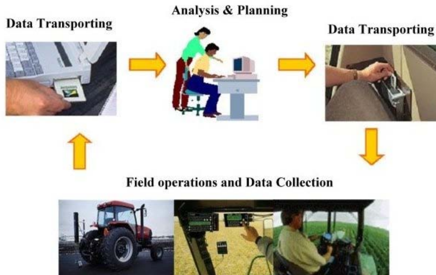
Figure 1: Typical data management process in farming

Field data collection is very important for efficient precision operations in agriculture production; and reliable and prompt data communication between sensing and data processing units is essential to make the sensed field data useful to operators in the field. Machinery positioning in the field during operation is one of the most common field data collection tasks in today's agriculture production. The machinery position provides the essential information for all kinds of site-specific management and provides the critical information for machinery navigation. GPS receivers are widely used on agricultural machinery to measure the absolute position in global coordinates directly using satellite-based positioning technology. In some applications, the relative position of the machinery to the travel direction is also very important. In those cases, inertial sensors are often used to determine the relative position. To improve the positioning accuracy and robustness, an integration of GPS and inertial sensors can provide a complementary correction for agricultural vehicle applications. Such an approach, that is, using multiple positioning sensors, could provide precise navigation information to guide a piece of agricultural machinery traveling along the crop rows in conducting various farming operations. Kalman filter technology is often applied to fuse the signals from the complementary sensors for abstracting robust and accurate data to support real-time field operations.