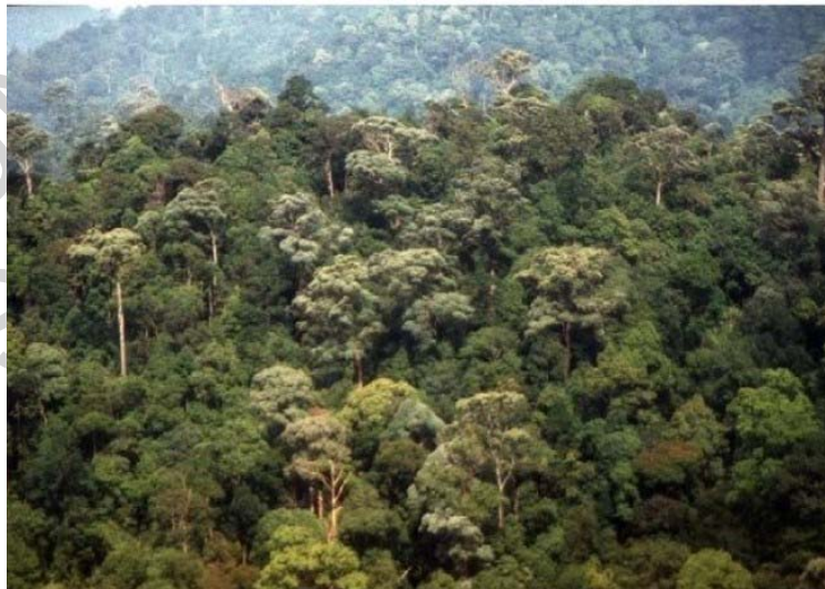
Figure 1. Tropical lowland evergreen rain forest.

Tropical rain forests (Figure 1) contain a greater diversity of plant and animal life than any other vegetation type. In the most species-rich forests, every second tree may be a different species, whereas in temperate forests, every second tree is likely to be an oak or a pine. The diversity of tropical rain forests is well illustrated by reference to Australia, where tropical rain forests cover a mere 0.5% of the continent, yet this tiny area includes 50% of the plant and animal species recorded from the whole continent. Because of the immense diversity of tropical rain forests and their constituent fauna, their intrinsic value is much greater than forests of temperate lands; they contain an immensely greater gene pool, necessary to safeguard a long future for plant and animal life on this planet. They also form a major source of hardwoods, of many plant and animal products, and also of chemical compounds which have been developed by plants as protection against attack by herbivores. They are also a major absorber of atmospheric CO 2 , and thus help regulate global climate, providing a buffer to the deleterious effects of global warming. This chapter presents a brief outline of present-day tropical rain forests, and then presents an overview of their geological history from the time of appearance of the flowering plants, with which they are overwhelmingly dominated, up to the present day.