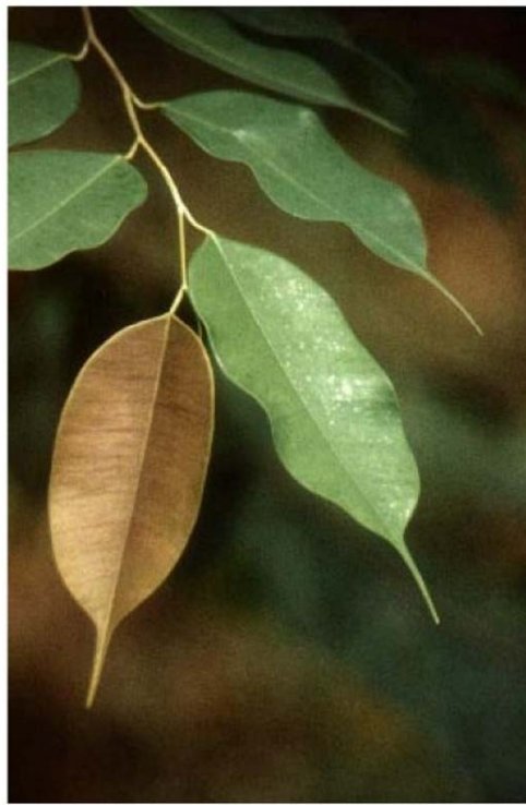
Figure 4. Leaves with pronounced drip tips, Bogor Indonesia.

between these areas, and thus it provides us with one of the classic examples of convergent evolution. It is typically dense, evergreen forest, with trees reaching 50–70 m in height, and is often devoid of ground flora (Figure 3). The tree component is typically very diverse, and gregarious dominants are generally uncommon. Tropical rain forest is popularly regarded as being multilayered, with tree crowns forming distinct strata, but in practice, such layers are rarely well defined. For instance, in Equador, no clear vertical discontinuity of structure could be discerned at any level and strata could be delimited only arbitrarily. Tree crowns are rarely stratified in tropical rain forest because they are composed of a very large number of species, each maturing at different heights and reacting differently to light and other factors. Boles are usually straight, often with smooth or dimpled bark and buttresses are common. Cauliflory and ramiflory are frequent. Leaves and leaflets are generally coriaceous, and of mesophyll size, with pinnate leaves being common. Leaf margins are typically entire, frequently with drip tips irrespective of leaf organization (Figure 4). Lianes and woody climbers are common which often bear peltate leaves. Epiphytes are also common and diverse. All other rain forest formations differ from tropical evergreen lowland rain forest in having lower species diversities, fewer life forms, and simpler structure.