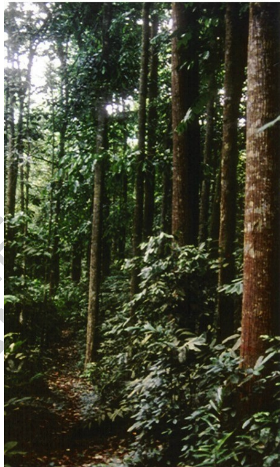
Figure 3. Inside tropical lowland evergreen rain forest. Note absence of branching and lack of ground flora.

The tropical lowland evergreen rain forest formation is the richest, and most luxuriant of all plant communities, and occurs in areas which experience a wet tropical climate without dry seasons. It is this vegetation type with respect to which frequently exaggerated descriptions have been made by early explorers and writers, and is often referred to as "jungle," mainly through popular writings, although this word actually refers to seral vegetation in North India. These are also the forests which are currently being most extensively exploited for their rich timber resources.