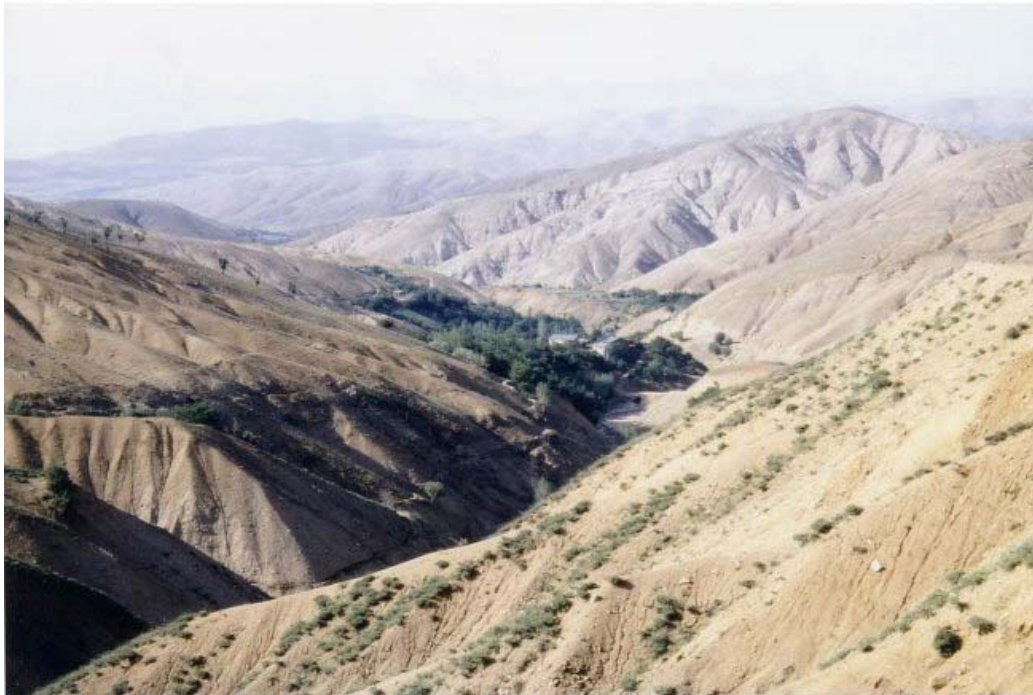
Figure 1. Badly eroded hills in northeastern Turkey, cleared of their natural forests and heavily overgrazed

Under natural conditions, different environments evolve which vary according to the available variety of plants and animals and the existing soil, climate and topographic conditions. These environments exist in a state of dynamic equilibrium, a state where they are usually able to adjust and recover after some unusual event such as the outbreak of a disease, a fire, or a drought. Wherever humans have settled and cultivated and grazed the land with their domesticated animals, these conditions have been upset and changed. In some places, and over time, new forms of land use have evolved which are in harmony with the soil, climate, and topography and a new, productive, and stable environment has been established. Unfortunately, this has not always been the case and over large areas of the world's surface land use systems are to be found which are not in balance. Where this is the case, various forms of land degradation are taking place.