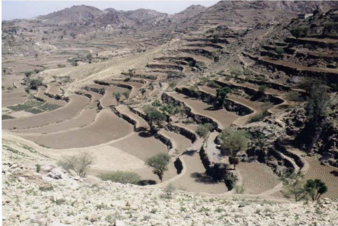
Figure 2. Beautifully built terraces in Yemen carefully maintained over the centuries

Great interest has been shown in these traditional soil-conservation systems in recent years and a number of studies have been conducted to find out more about them and if they can be adapted to present day conditions.