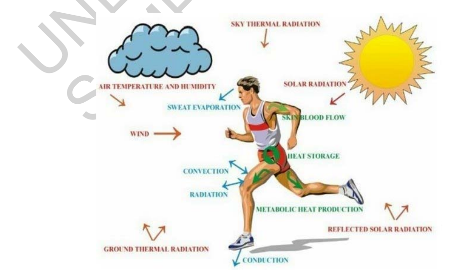
Figure 2. Heat exchange between the body and the environment

Heat exchange by radiation (R) is defined as a gaining (absorption) or losing (emission) of heat energy at the expense of radiation energy. The emissivity of human skin is equal to 0.997. There is a continuous heat exchange by radiation between the skin surface and material bodies in the environment (for example, solar radiation, walls) when any difference in their temperature exists. The radiation is a very powerful source of energy. Human beings can partly protect against radiation by using special clothes and shields.