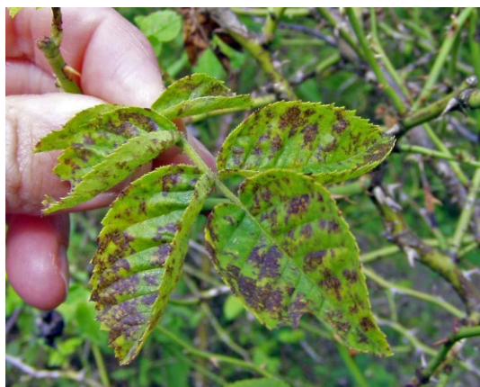
Figure 3. The fungal disease blackspot ( Diplocarpon rosae perfect stage, or Marssonina rosae imperfect stage)

Analyses of resistance against fungal diseases in ornamental roses and some diploid wild species, have demonstrated both polygenically controlled, horizontal resistance and vertical, race-specific resistance conferred by major genes, e.g., Rdr1 and Rbs providing resistance against blackspot, Marssonina rosae (Kaufmann et al., 2003; Yan et al., 2005b), and Rpp1 and Rpm providing resistance against powdery mildew (Linde et al., 2004; Zhang, 2003). In dogroses, both blackspot and powdery mildew instead appear to be under polygenic control since at least some symptoms can be found on all investigated species so far (Carlson-Nilsson and Uggla, 2005; Uggla and Carlson-Nilsson, 2005; Schwer et al., 2007). Similarly, rust and Sphaceloma -leafspot occur in all dogrose species evaluated although at variable levels (Schwer et al., 2007). Boerema (1963) reports that some dogrose species like R. canina , R. tomentosa , R. villosa and R. rubiginosa are susceptible to Septoria -leafspot, whereas other species lack symptoms altogether. In a Swedish study, R. rubiginosa had no symptoms although other species in the same field were heavily infested, suggesting a genetically controlled, perhaps monogenic resistance (Schwer et al., 2007).