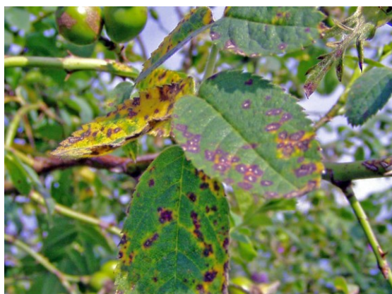
Figure 4. The fungal disease leafspot ( Sphaceloma rosarum ) also known as anthracnose