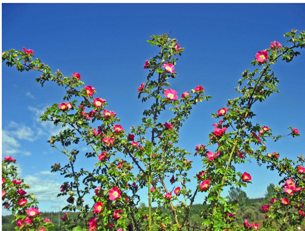
Figure 1. Rosa rubiginosa in full bloom

Traditionally, dogrose species have been defined according to morphological characters like leaflet shape, hip shape, length of pedicel, presence or absence of glandular hairs, shape of prickles, shape of style head orifice, leaf pubescence, and plant shape. Although some discontinuities are noted, these characters have often been insufficient for unambiguous classification of plant material, even when this material has been grown in comparative garden trials (Nybom et al. 1996, Olsson et al. 2000, De Cock et al. 2008).