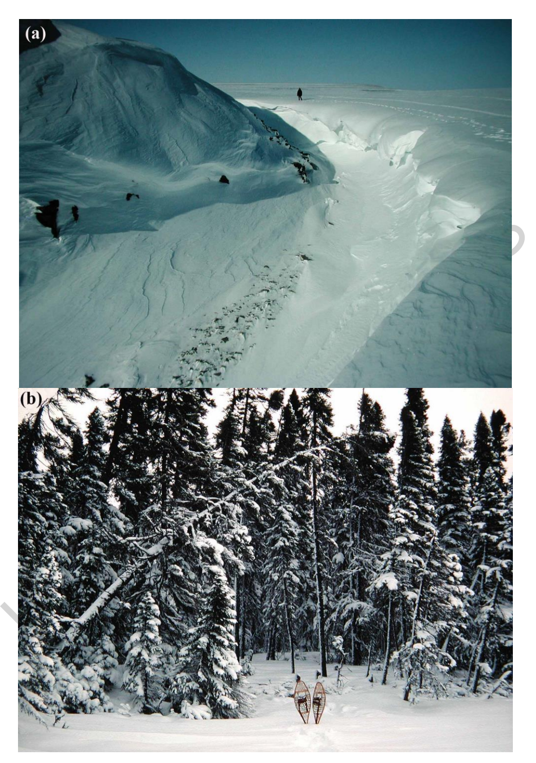
Figure 4. (a) Arctic snow re-distributed by wind to form an uneven cover, with some areas swept free and other areas producing large cornices. (b) Snow intercepted by Subarctic tree canopy. Intercepted snow may subsequently fall off the trees but it is also subject to sublimation loss.

dunes and sastrugis. Tundra vegetation and shrubs in the Low Arctic are often partly or wholly buried by the snow.