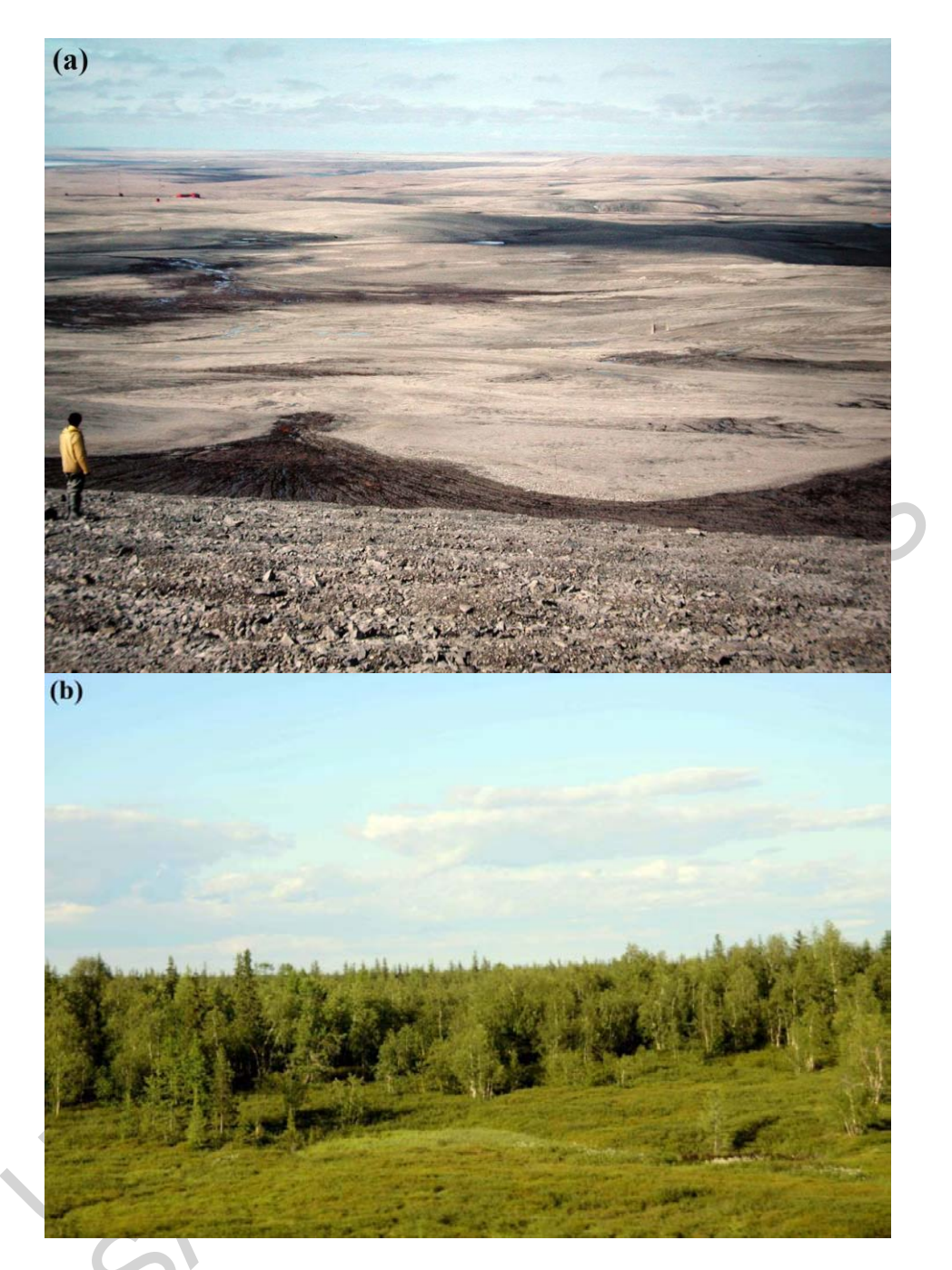
Figure 2, (a) High Arctic polar desert landscape with predominantly barren ground interspersed with moist patches that support tundra vegetation growth, Resolute,Cornwallis Island, Canada. (b) Forest margin with tundra-shrub at Salekhard in Siberia, Russia. The forest consists of spruce, larch and birch, and undergrowth of shrubs.

The North includes large land masses of northern Eurasia and North America, as well as islands of various sizes juxtaposed with ocean straits and sea inlets, most of which acquire an ice cover in part or most of the year. All major rock types are represented in the North, from strongly metamorphosed Precambrian rocks of 0.6 to >2.5 billion years in age, to volcanic and sedimentary beds that continue to form. Topography is highly varied, encompassing large plains that rise from the Arctic coast to considerable