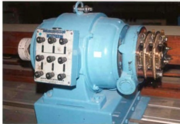
Figure 3. A 1.8-kW wound-rotor induction motor

The rotor winding is a distributed polyphase winding similar to that of the stator and has the same number of poles. The phases are usually star-connected, with the lines brought out to insulated slip-rings that make contact with stationary carbon brushes. Under normal operating conditions, the slip-rings are short-circuited at the brushes, but external resistances can be connected to the carbon brushes for motor starting and speed control. An induction motor with a wound rotor is often called a wound-rotor induction