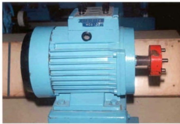
Figure 4. A 2.2-kW squirrel-cage induction motor

A cage rotor (or squirrel-cage rotor) winding consists of copper or aluminum bars housed in the rotor slots. All the bars are short-circuited at their ends by two end-rings. If aluminum is used, the cage winding may be manufactured in a single die-casting process. For a cage winding, the number of poles depends on the currents induced from the stator rotating field, hence a given cage rotor can operate satisfactorily for stators with different pole numbers. Figure 4 shows a 2.2-kW squirrel-cage induction motor.