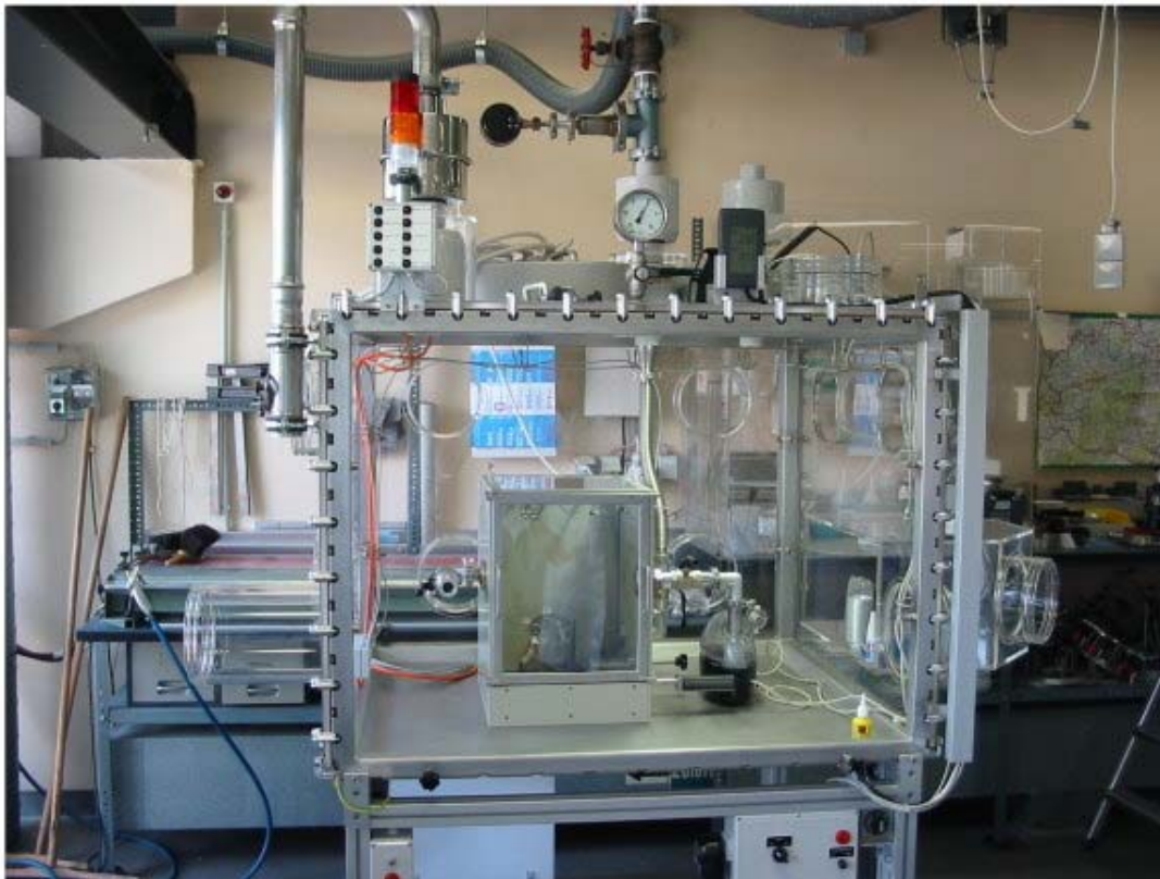
Figure 3: Glove-box for taking fingerprints from contaminated items. The pieces of evidence are exposed to cyanoacrylate vapor in the chamber inside the glove-box.

Classical forensics is a well established discipline with roots reaching far back in the past. In the present context we want to focus on forensic investigations that are carried out on nuclear or radioactive material. The analytical techniques that are applicable refer to investigations of the packing material, of associated materials and of traces (hair, fiber, cells, fingerprints) associated with the radioactive material. Results of such classical forensic investigations provide information that is complementary to the clues obtained from the nuclear forensic analysis. Hence, it will help to establish a more complete picture of the case.