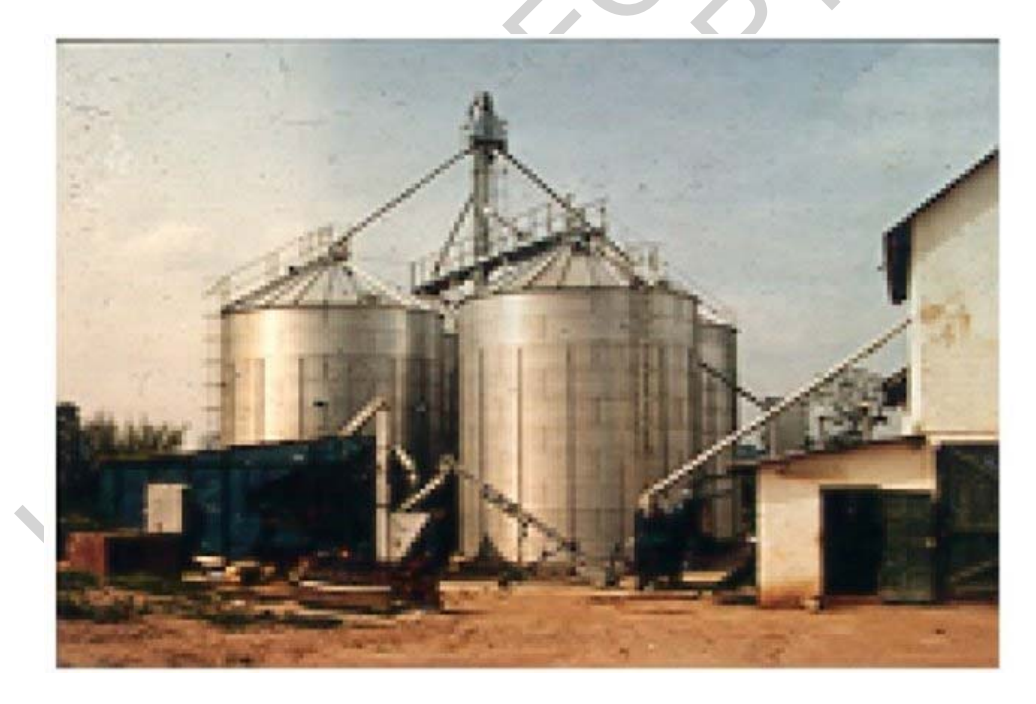
Figure 3. Corrugated steel silos for grain storage.

Durable produce . Grain conveyors do not have the same protective constraints as perishable crop conveying systems. Nevertheless, some precautions may need to be taken according to the intended use of the crop. Some grain conveyors may incorporate a thrower to help distribute the grain to the far reaches of the store to permit full use of the storage space. Galvanized steel silos are probably the most popular type of store (Figure 3).