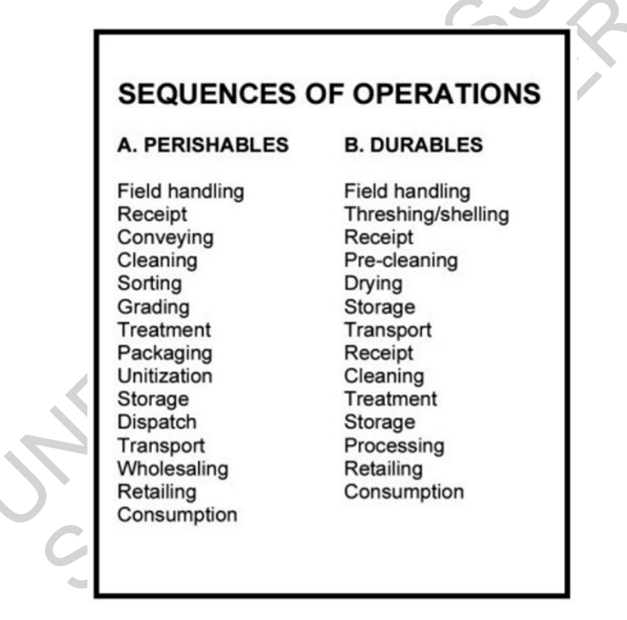
Figure 1. Generalized post-harvest handling schemes for perishable and for durable crops.

Post-harvest operations tend to link to one another to form handling systems. The following discussion progresses through the handling system from immediately after harvest to the point of consumption or other use of produce (Figure 1).